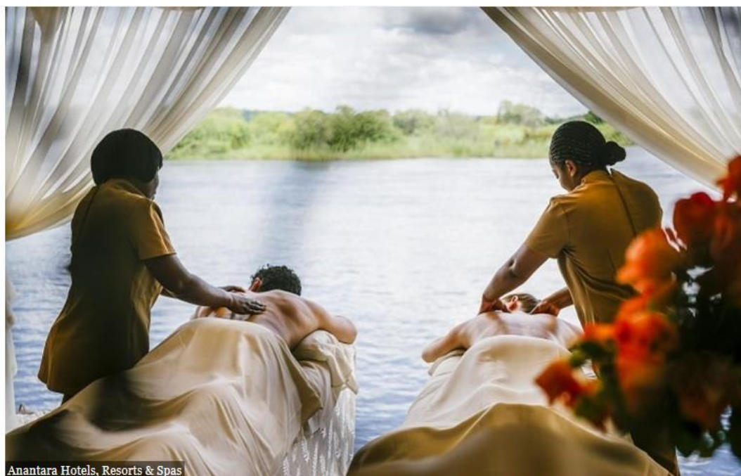
Anantara Hotels, Resorts & Spas

One of the best things about the hotel is its location, right on the banks of the mighty Zambezi River, inside Mosi-oa-Tunya National Park, named for the local title of the Falls, meaning “The Smoke That Thunders.” It has its own dock, which is very handy as river cruises and boat trips to Stanley Island are popular diversions here, and it has direct access to the Zambia side of Victoria Falls itself, just a 15 minute walk from your room. Now known as the Royal Livingstone Victoria Falls Zambia Hotel by Anantara , the resort has taken further advantage of its one of a kind setting by building three new riverside spa gazebos, giving guests the rare opportunity to enjoy treatments alongside the Zambezi River, to a natural soundtrack of rushing water, birdsongs, and the calls of nearby wildlife. Anantara is known for heavily incorporating local products and tradition to give each resort a distinct sense of place, and options here include romantic side-by-side couples’ treatments, a special foot massage or the new signature Zambezi Massage, using locally made African floral oil and relieving sore muscles with a combination of massage and stretches, incorporating elements of traditional Thai massage.