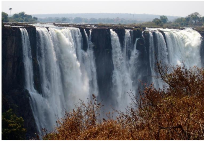
Victoria Falls, the world's largest single waterfall and one of the 7 Wonders of the World.

Opinions expressed by Forbes Contributors are their own.