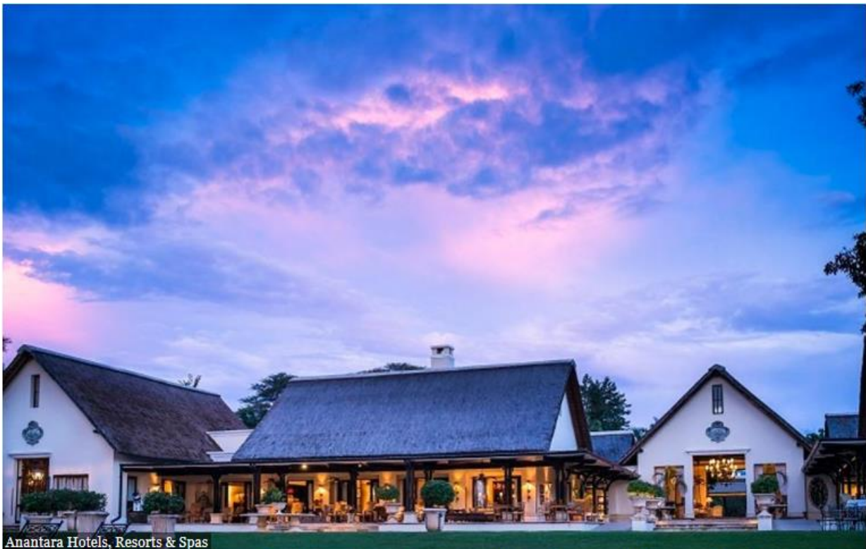
The Royal Livingstone was built in traditional British Colonial style architecture; this is one of the bars and restaurants. [-]

rafting on the Zambezi is extremely popular and often rated the world's best one-day raft trip, starting just below the falls and running a long series of crazy looking rapids. There are also conventional African wildlife safaris in nearby national parks on both sides of the river, though these are long day trips and because most people who visit the Falls are tacking onto a trip to South Africa or Botswana, it makes more sense to do the fantastically high-quality game viewing those destinations offer first. But the bottom line is that is possible to base yourself in Livingstone for four or five days, or more, filling your time with nonstop activities, especially with kids in tow. And there is no better place here to stay than at The Royal Livingstone.