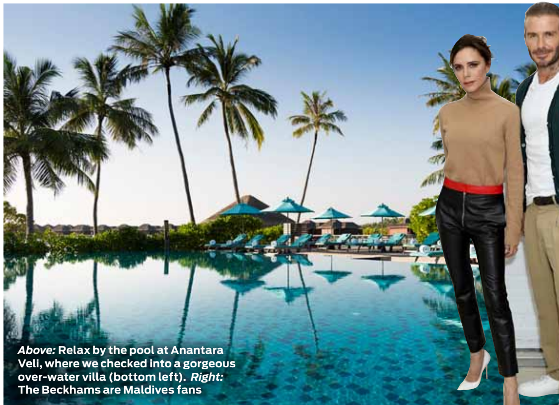
Above: Relax by the pool at Anantara Veli, where we checked into a gorgeous over-water villa (bottom left). Right: The Beckhams are Maldives fans

MAKE YOUR NEW YEAR'S RESOLUTION COME TRUE THIS YEAR BY VISITING THE MALDIVES