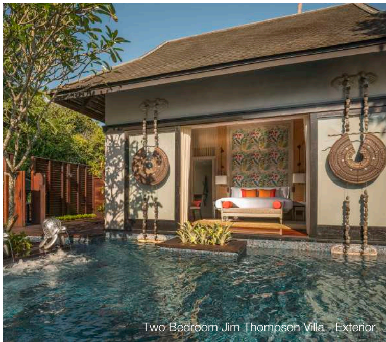
Two Bedroom Jim Thompson Villa - Exterior