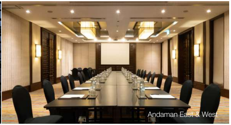
Andaman East & West