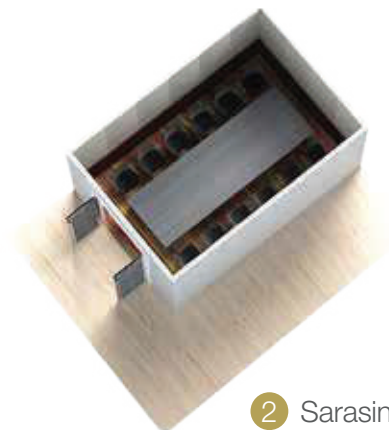
2 Sarasin Boardroom