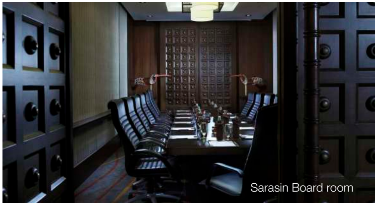
Sarasin Board room