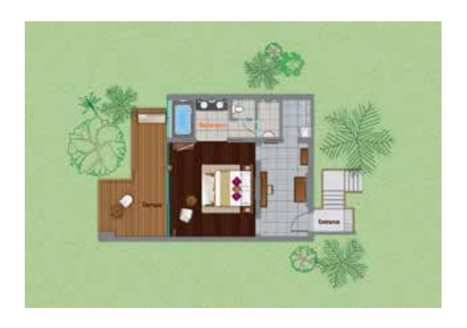
Deluxe Layan Suite