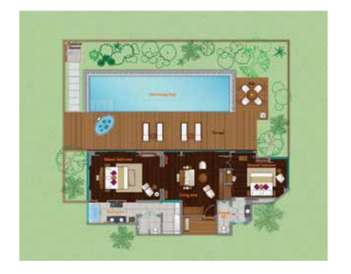
Two Bedroom Pool Villa