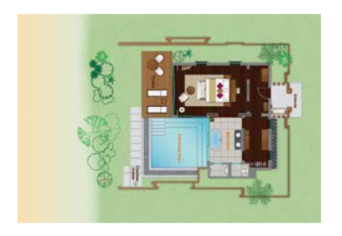
Beach Access Pool Villa