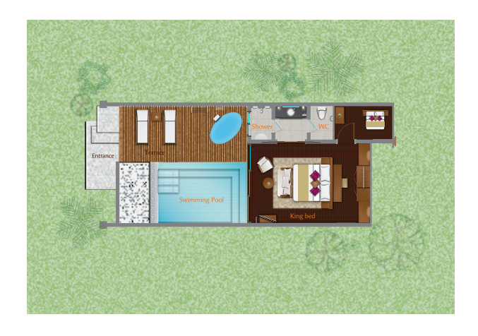
Family Pool Villa