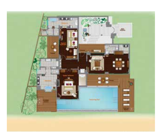
Two Bedroom Anantara Pool Villa