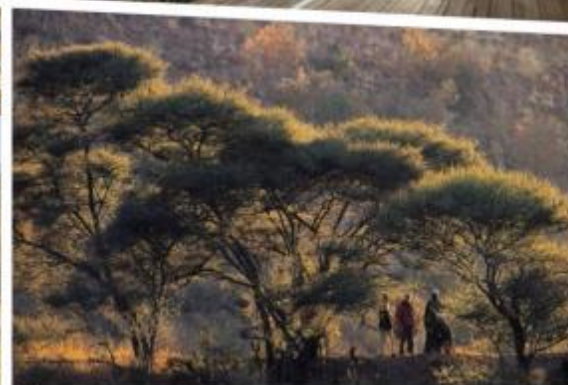
CLOCKWISE FROM TOP RIGHT: SINGITA LEBOMBO LODGE; MATEYA WALKING SAFARI; A TWIST ON SUSHI AT SINGITA; ELEPHANTS IN FRONT OF MATEYA SAFARI LODGE AND INTERIOR OF SUITE; GAME DRIVES AND INFINITY POOL AT SINGITA.