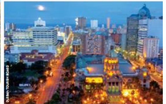
DURBAN TOURISM BOARD