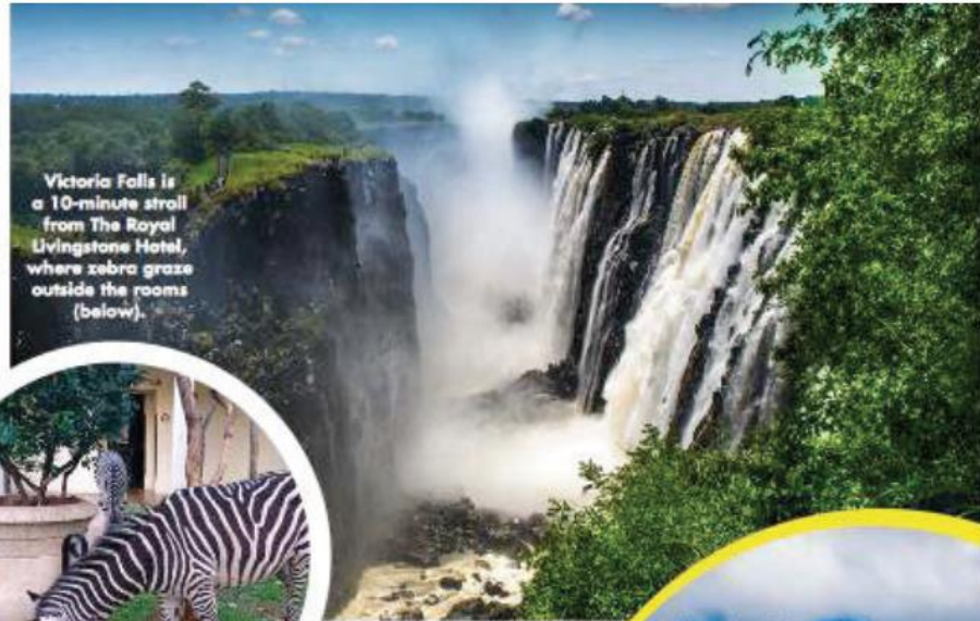
Victoria Falls is a 10-minute stroll from The Royal Livingstone Hotel, where zebra graze outside the rooms (below).

After checking into my luxurious suite with a sunroom overlooking the river, I spotted two giraffes casually foraging among the trees just metres from the room.