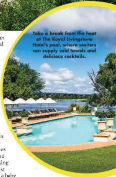
Take a break from the heat at The Royal Livingstone Hotel's pool, where waiters can supply cold towels and delicious cocktails.

The sounds of happy hippos grunting fill the air. This trip has been a once-in-a-lifetime experience never to be forgotten.