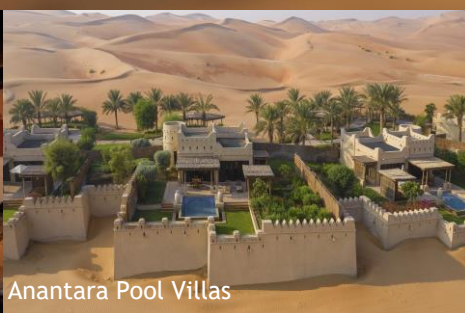
Anantara Pool Villas