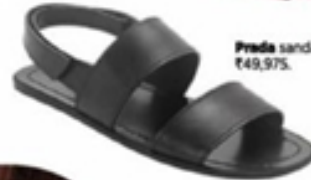
Prada sandals, ₹49,975.