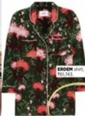
ERDEM shirt, ₹61,743.