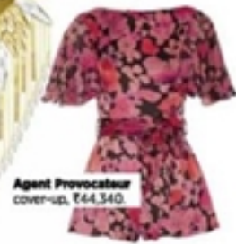
Agent Provocateur cover-up, ₹44,340.