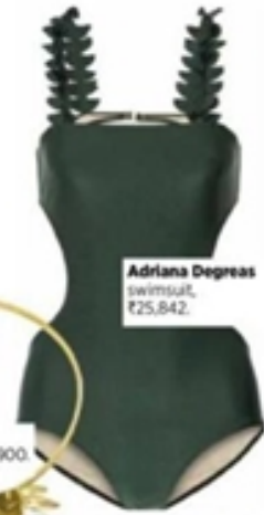
Adriana Degreas swimsuit, ₹25,842.