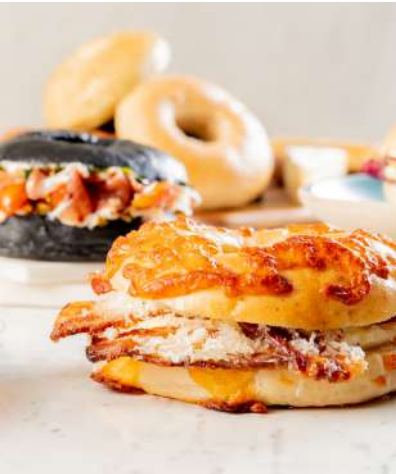
Sweet and Savoury Bagels