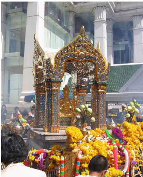
The Erawan Shrine

Often mistakenly referred to as the 'Four Faced Buddha', Lord Brahma, is actually the Hindu god of creation, who along with Lord Vishnu, the preserver and Lord Shiva, the destroyer, make up the Trimurti, the trinity of supreme divinity, in Hindu religion. His four faces represent the virtues of kindness, mercy, sympathy and impartiality. Although Lord Brahma is a Hindu god, it is virtually impossible to find a shrine dedicated to him, in India. However, here in Thailand, a predominantly Buddhist country, nearly every business, shopping mall, hotel (including ours) will have their own shrine within their grounds - this is