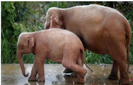
A pair of 'white' elephants

The Siamese King kindly offered to send some elephants to the White House, to assist during the Civil War - a truly heartfelt gesture and selfless offer; one which Abraham Lincoln politely declined.