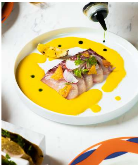
Toda La Vida Ceviche