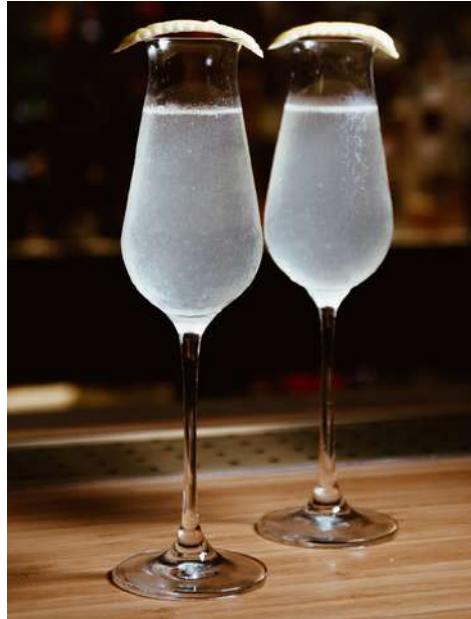
The 'French 75' and below, its namesake