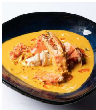
Chef Ali's South Indian Crab Curry

While Thai food has long been known for its bold and spicy flavours, when it comes to cooking with spices, no country even comes close to India, where an average of 4.8 million tons of spices are consumed annually.