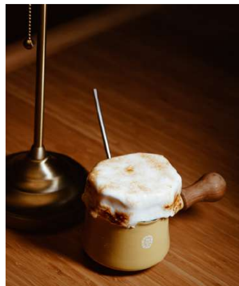
Manteca Y Dulce