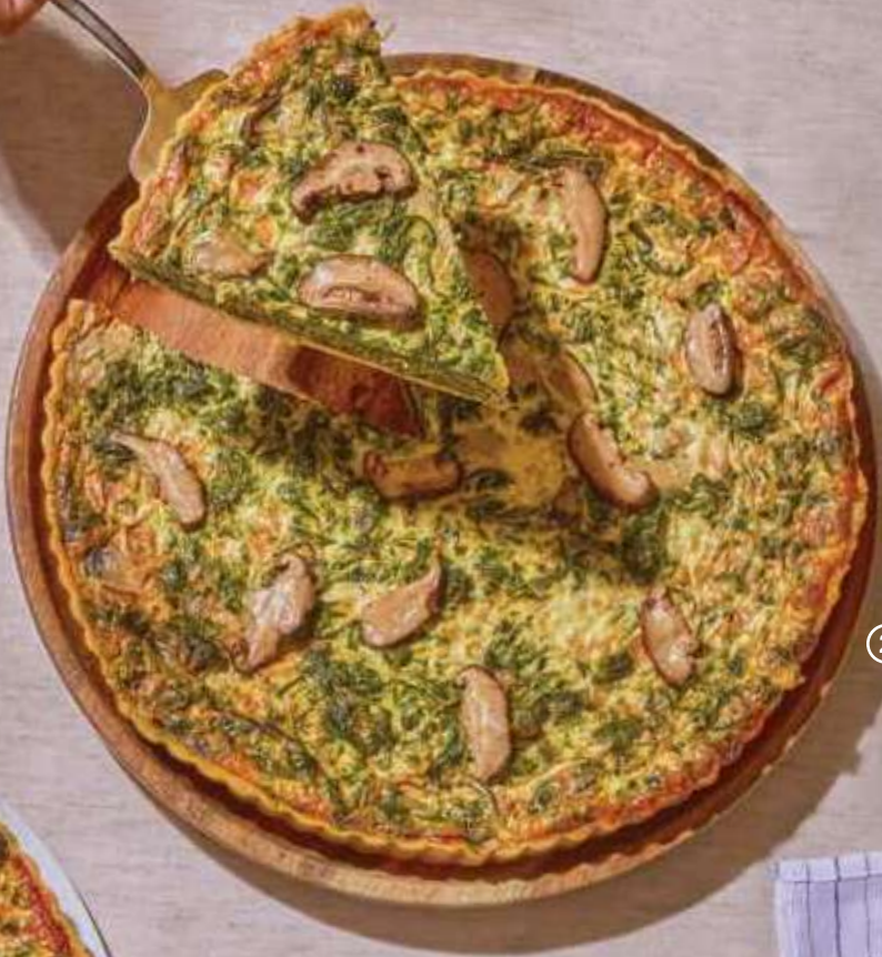
1. Smoked Salmon and Spinach Quiche 🌿 Cream, Spinach, Smoked Salmon, Mesclun Salad