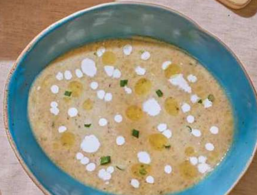
3. Traditional Lobster Bisque 🍤 🍷 Garlic and Saffron Croutons, Lemon Cream