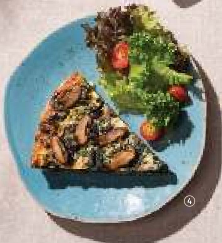
4. Mushrooms Spinach and Truffle Quiche 🍄 Paris Mushrooms, Baby Spinach, Truffle, Mesclun Salad