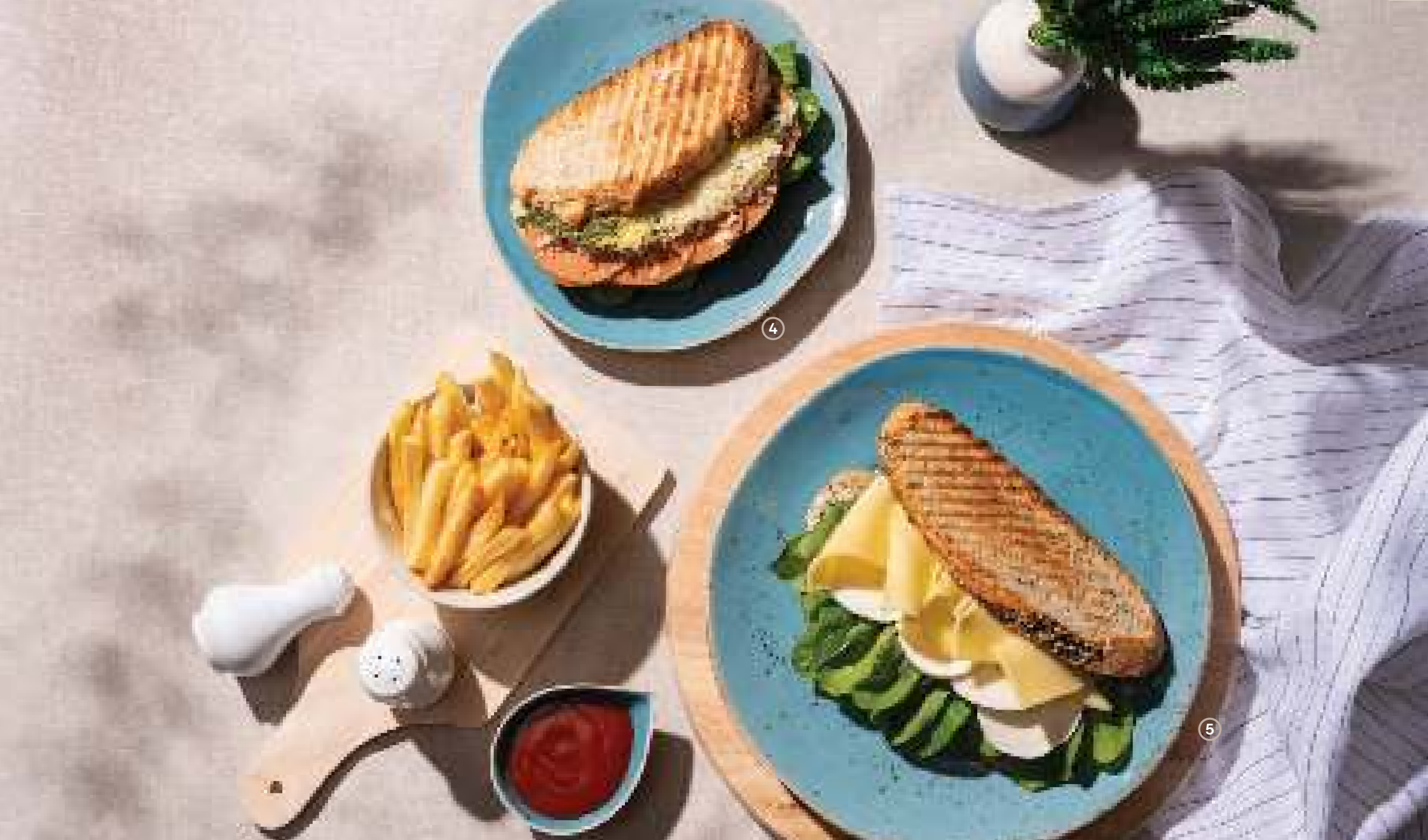
4. Vegan Cheese and Chorizo Toastie "Made with Kindness" 🌱🌱