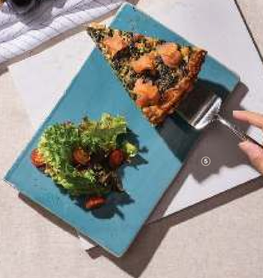
5. Smoked Salmon and Spinach Quiche 🐟 Cream, Spinach, Smoked Salmon, Mesclun Salad