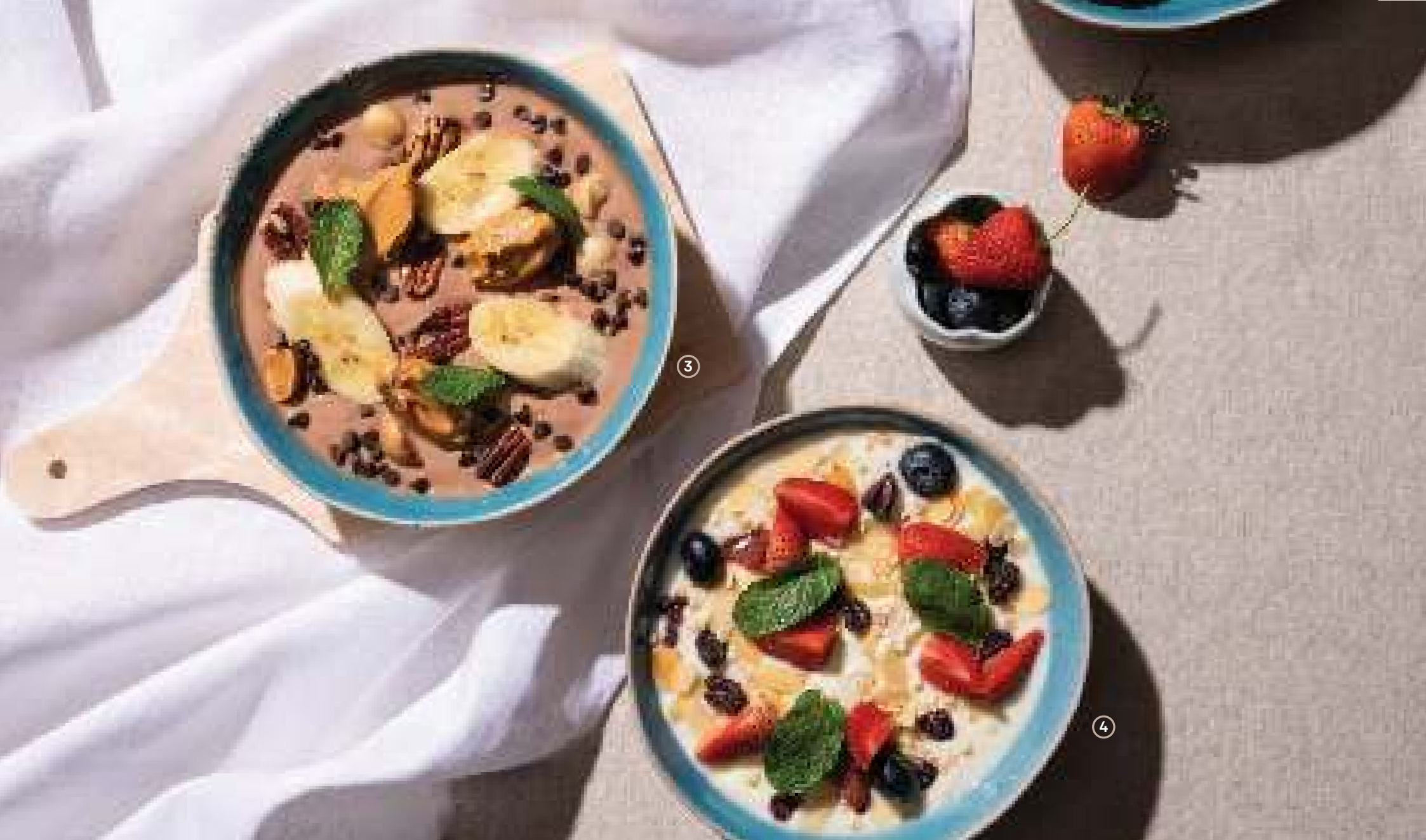
3. Banana Chocolate Power Bowl 🌱 🥥 Banana, Peanut Butter, Pecan Nuts, Macadamia Nuts, Chocolate Chips