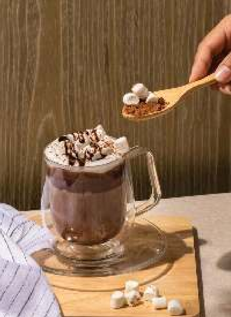
SIGNATURE HOT MOCHA