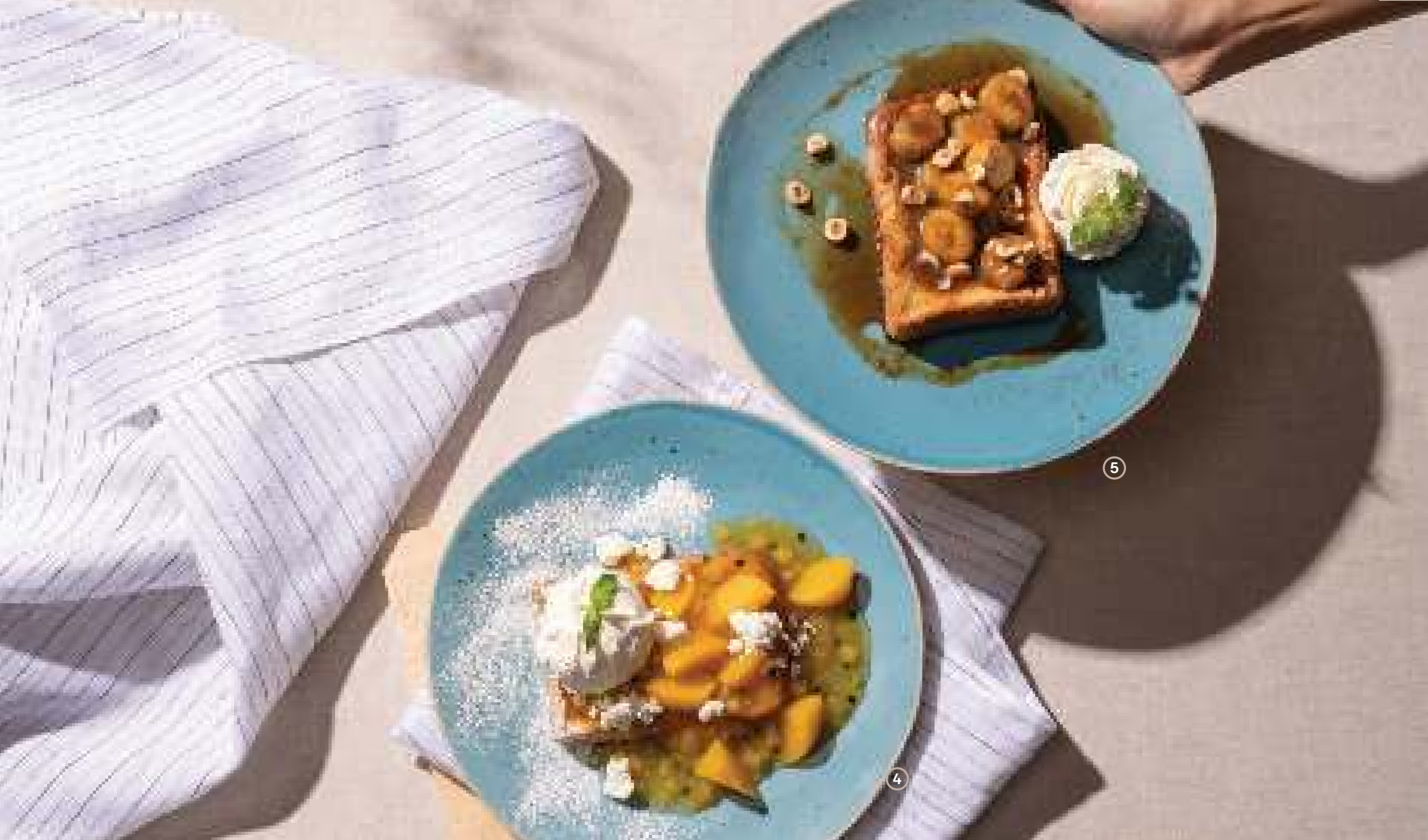
4. Peach and Raspberry French Toast 🌱 🌱 Almond Cream Custard, Peach Compote, Ricotta Cheese, Honey