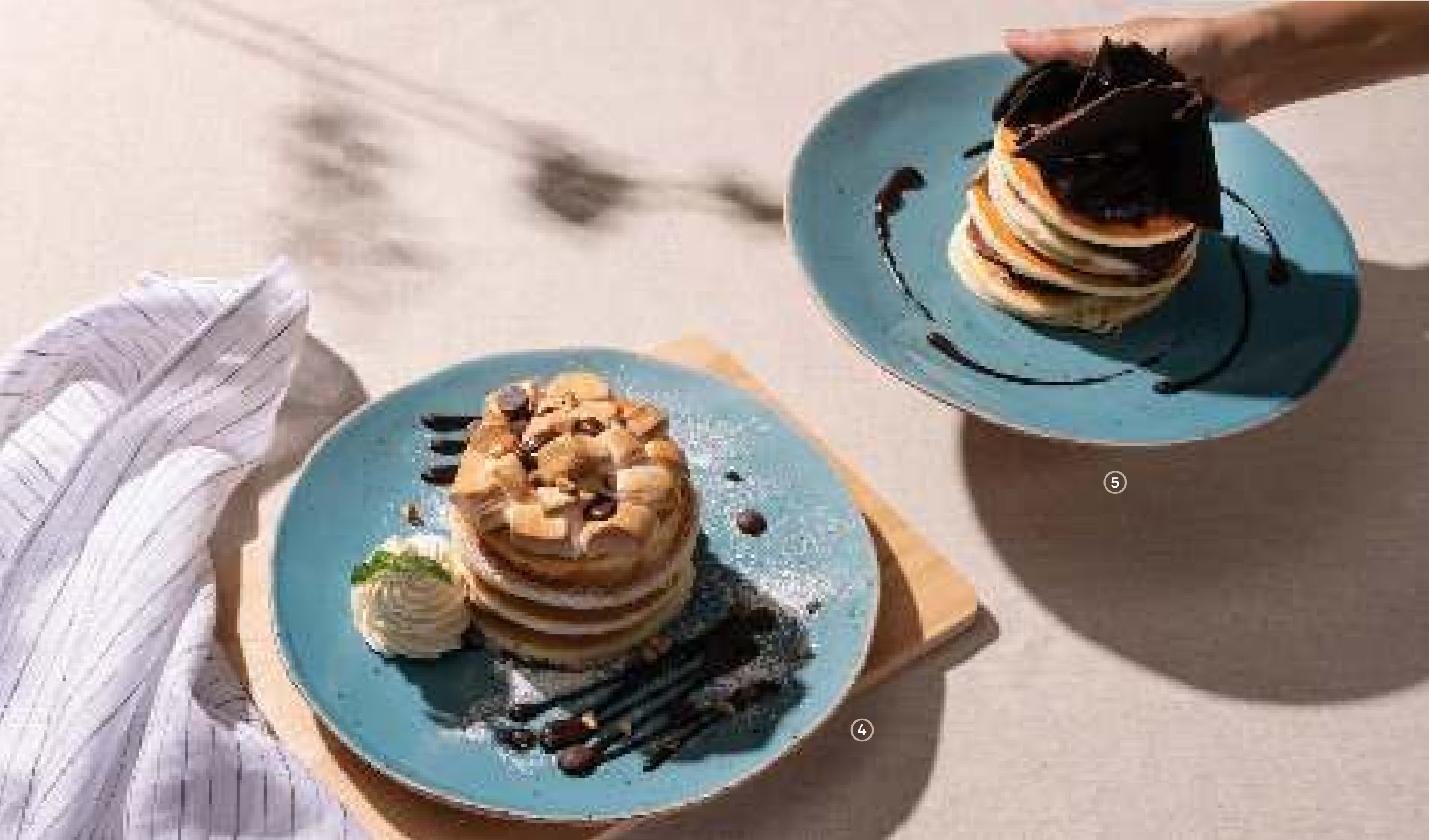
4. Rocky Road Pancakes 🌿 Buttermilk Pancakes, Melted Marshmallows, Chocolate Chips, Almond Chunky, Chantilly