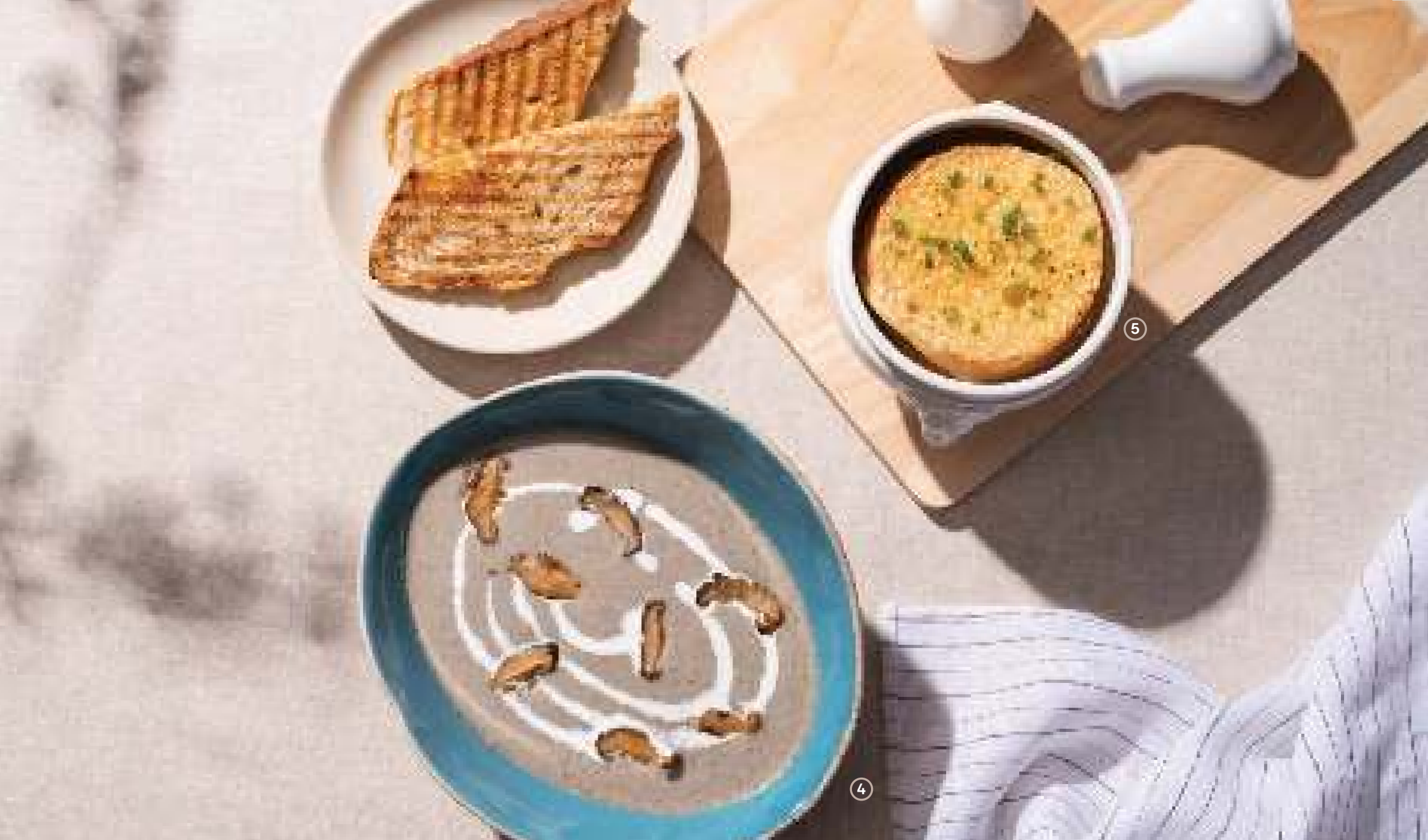
4. Cream of Mushrooms 🌿 Button and Portobello Mushrooms, Toasted Bread