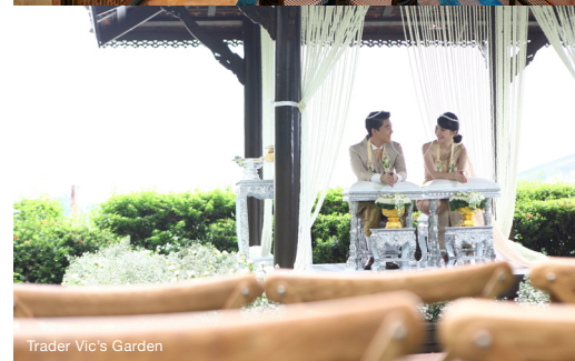
Trader Vic's Garden