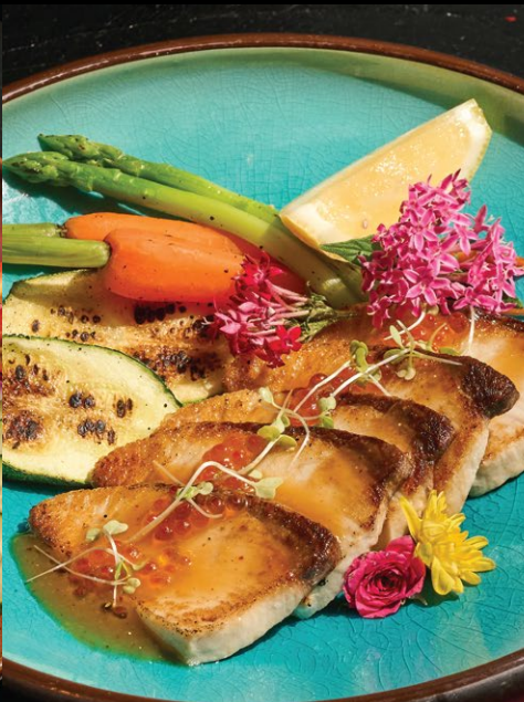
YELLOWTAIL HARMONY 990

Thinly sliced Japanese hamachi, mixed salad, avocado, ikura, yuzu dressing