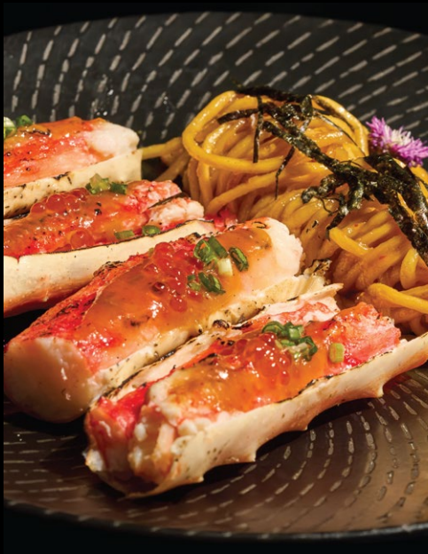
KING CRAB NOODLES WITH MISO 800