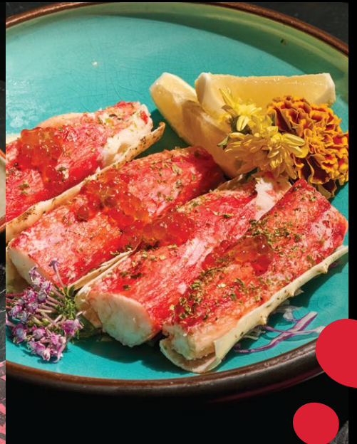
KING CRAB ROYALE TEPPANYAKI 1,150

Alaskan king crab, sushi rice, nori, asparagus tempura, avocado, mizuna, tempura flakes, ikura, spicy mayo, yuzu mayo