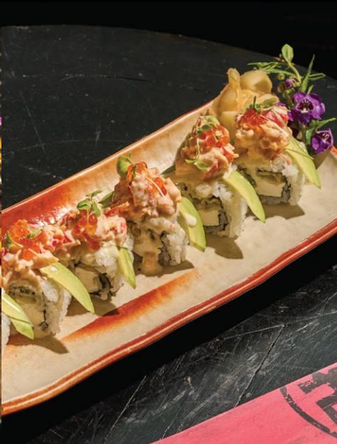
KING CRAB ROLL 590

Alaskan king crab, yakisoba noodle, sweet and savoury miso glaze, capsicum, ikura, sliced nori