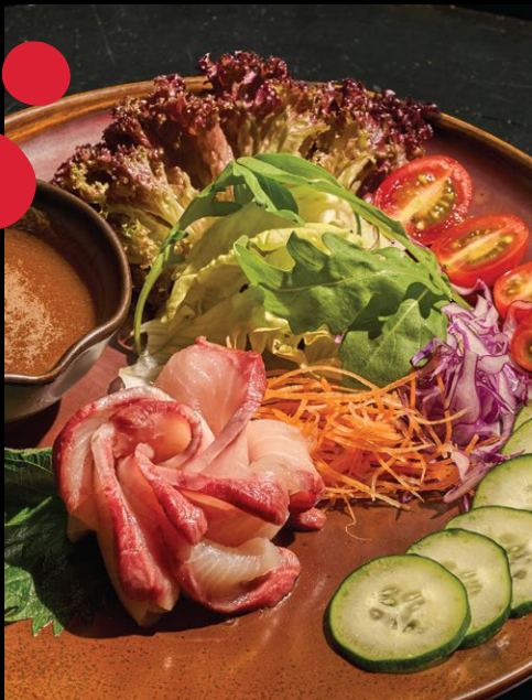
HEALTHY HAMACHI SALAD 590

Alaskan king crab with seafood mayo, ikura, nori aosa, wakame, sliced white and red cabbage, lemon