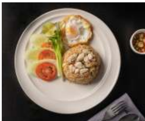
Thai Fried Rice

With the recent introduction of a new brand standard that highlights Anantara's Thai roots, three classic Thai dishes - Fried Rice, Green Curry, and Pad Thai - can now be savoured at every Anantara hotel or resort from Bali to Bangkok and Vienna to Victoria Falls. This delightful initiative ensures that guests enjoy an authentic taste of Thailand during their travels, celebrating the rich flavours and culinary traditions that inspire the Anantara experience and the brand's rich heritage.