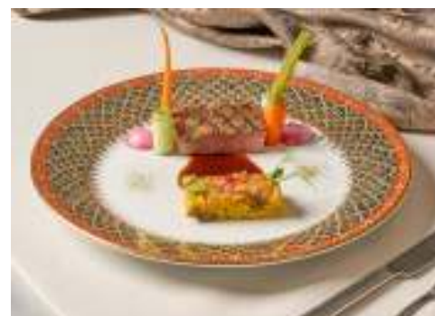
Thai wagyu with biryani rice