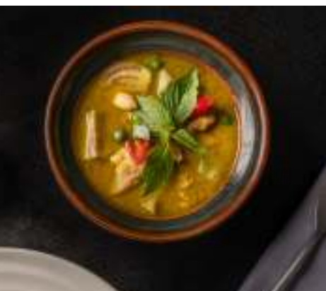
Thai Green Curry