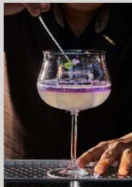
The Wang signature cocktail

Join us at Longtail River Bar & Lounge, for lunch or dinner, every day and take a taste journey through Thailand's iconic waterways, where you can enjoy unique and authentic flavours that immerse you in the stories behind each and every exquisite sip.