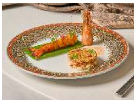
Goong Sorn Klin, grilled prawn salad

For reservations, please contact the concierge or dial '0' for our Guest Service Centre.