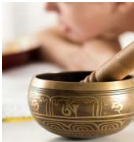
A Tibetan singing bowl

Guests will be transported to the foothills of the Tibetan plateau, as a herbal compress works strategically along the meridian lines, while the bronze bowls are struck, allowing the sounds and vibrations to penetrate deep into the body, releasing tension and relaxing the mind.