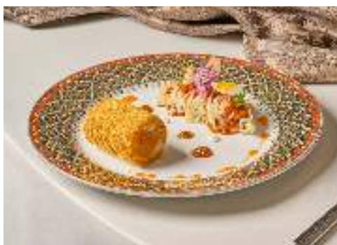
Khao Soy with cod fish