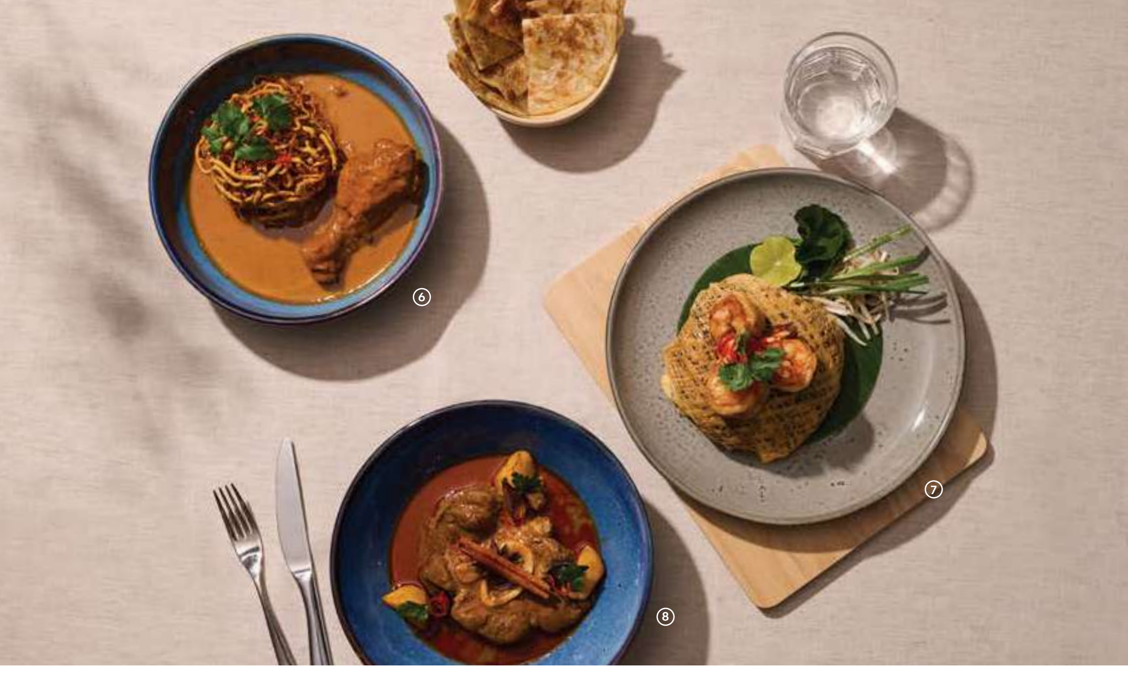
6. Khao Soi Gai Yellow Curry, 'Egg' Noodles, Chicken Drumstick, Cordyceps Mushrooms, Red Onions, Coriander, Chili Oil