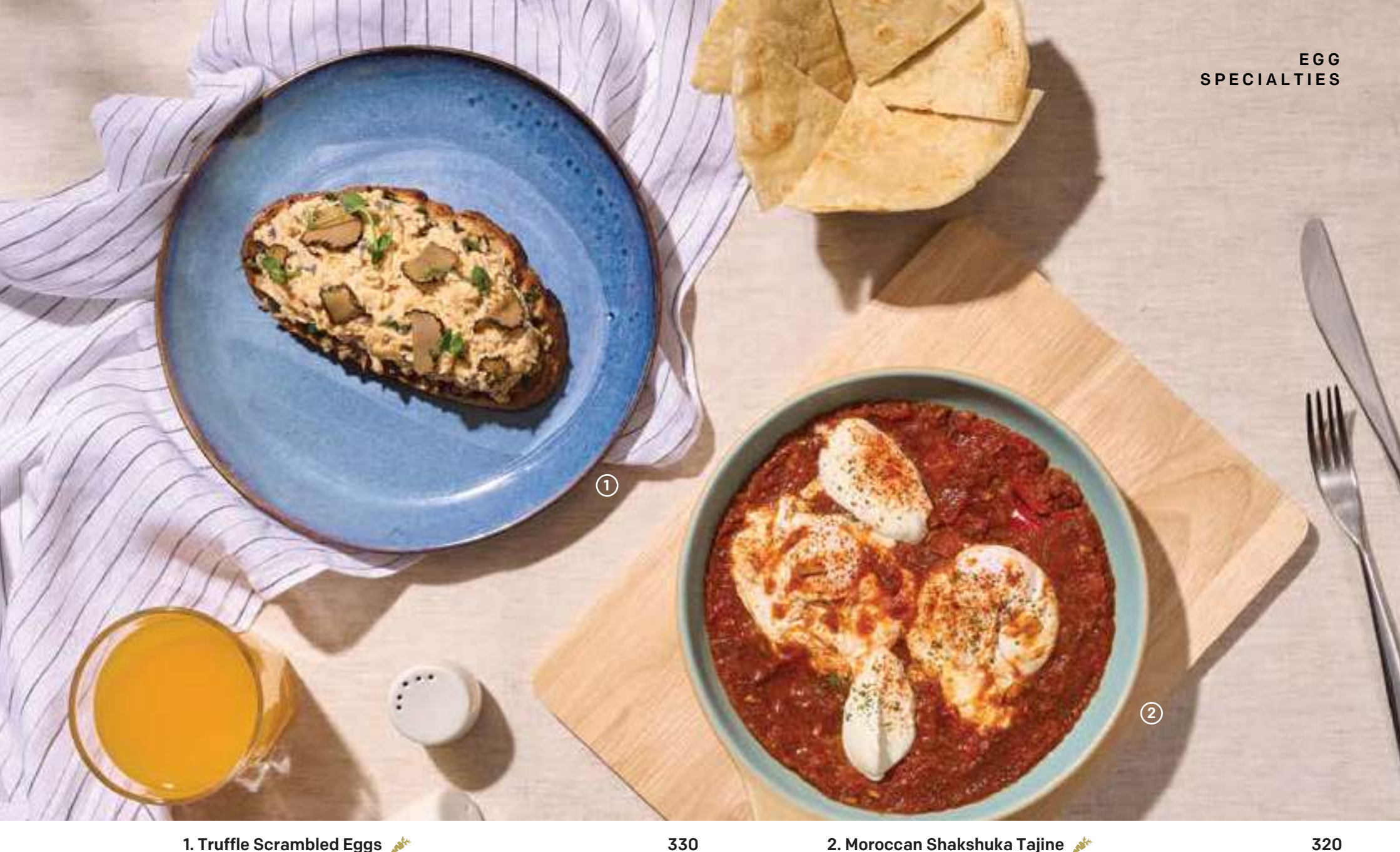
1. Truffle Scrambled Eggs 🏄 Black Truffle, Mushroom Duxelles, Sautéed Spinach, Sourdough Bread