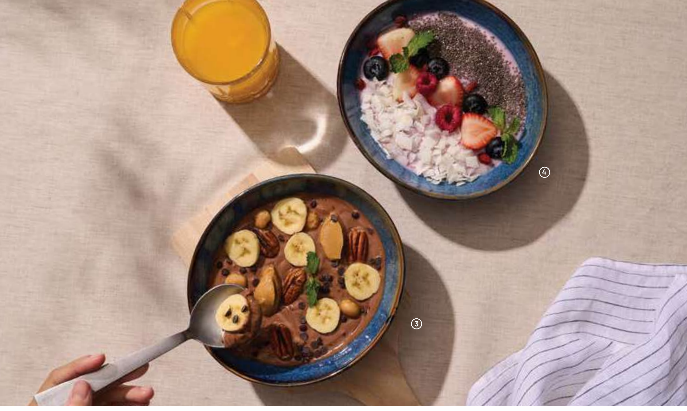
3. Banana Chocolate Power Bowl 🏄 🔊 320 Banana, Peanut Butter, Pecan Nuts, Macadamia Nuts, Chocolate Chips