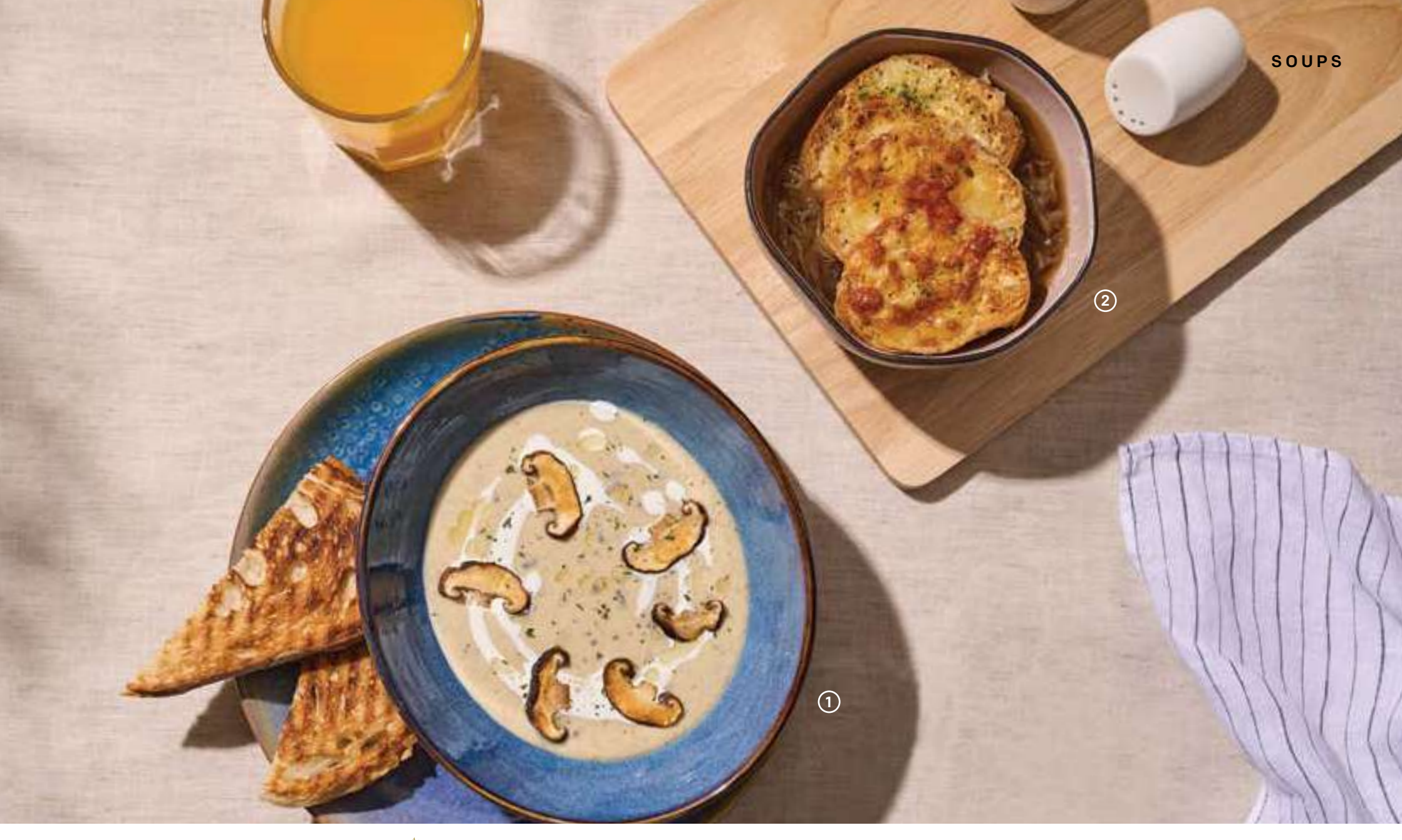
Black Truffle Vichyssoise 240 Black Truffle, Mushrooms, Potatoes, Leek, Thyme, Cream, Toasted Bread