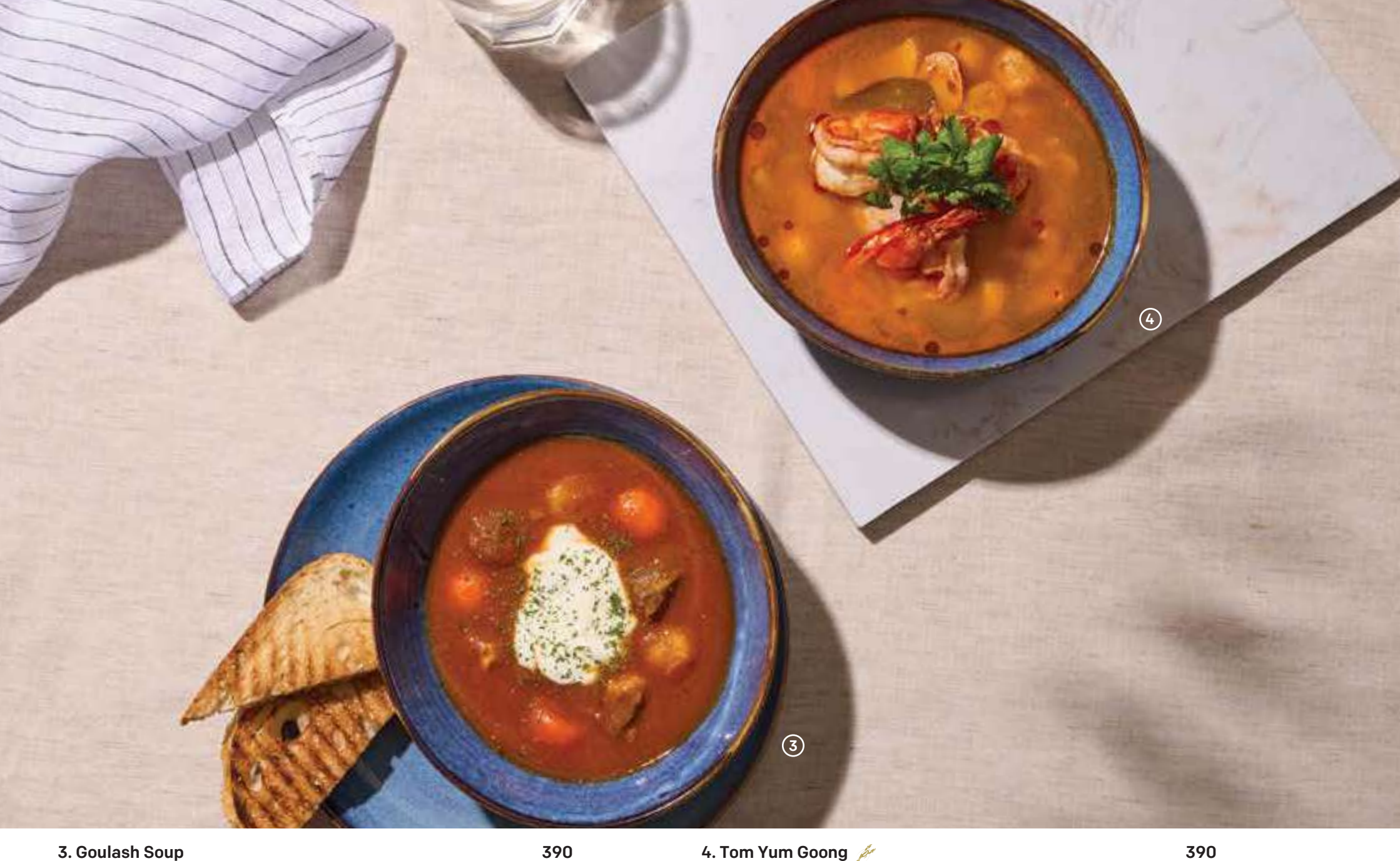
3. Goulash Soup Braised Beef, Onions, Sour Cream, Chives, Sourdough