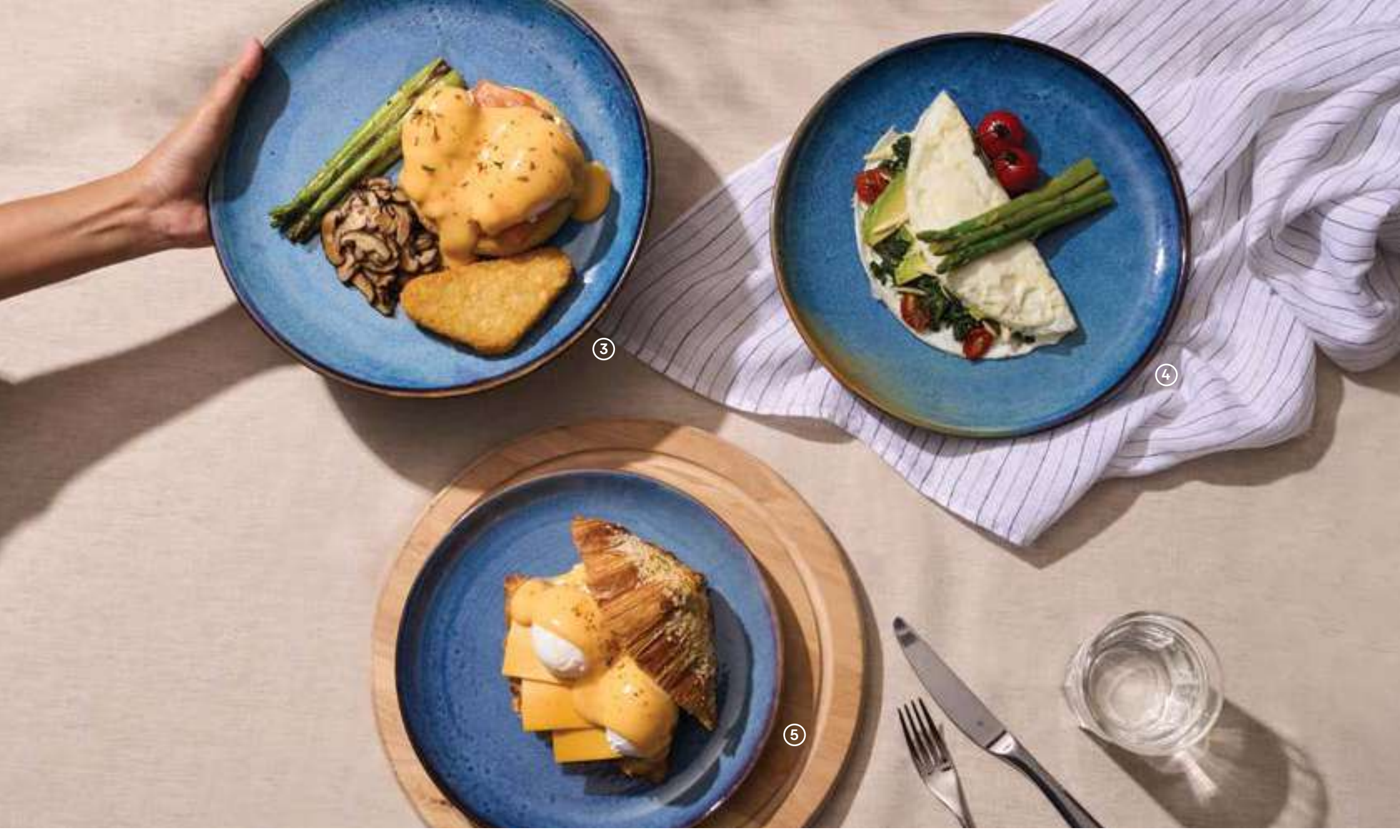
3. Smoked Salmon Benedict 🎉 320 House Smoked Salmon, Muffin, Poached Eggs, Hash Brown, Asparagus, Mushrooms