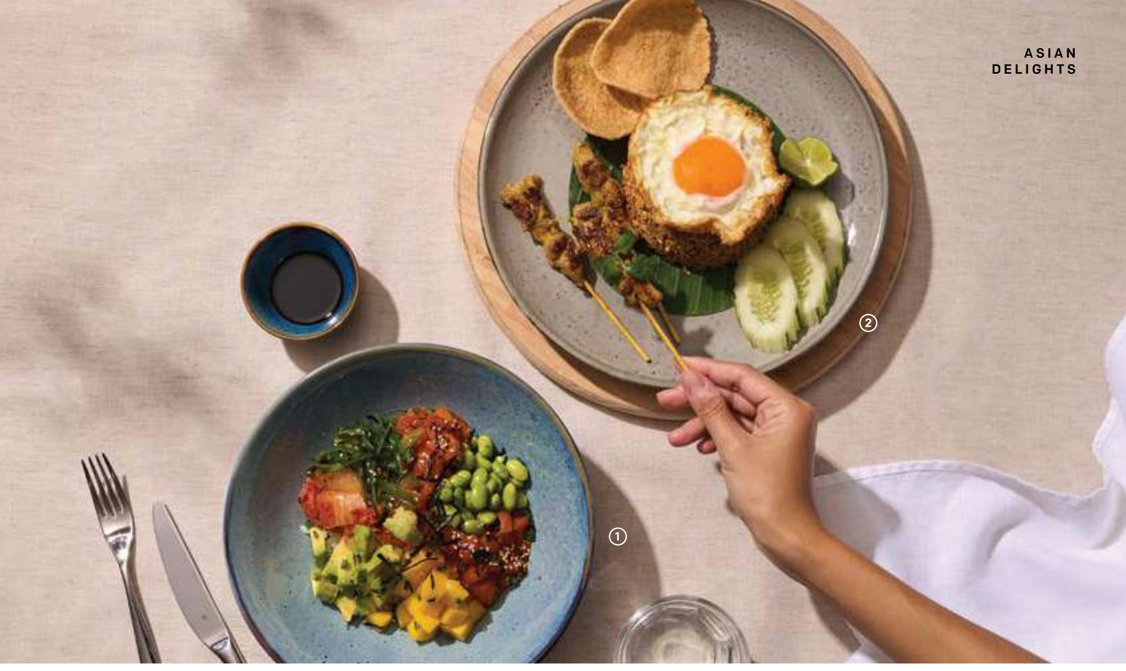
Korean Salmon Poke Bowl 460 Gochujang Marinated Salmon, Mango, Edamame, Avocado, Kimchi, Spring Onion, Seaweed