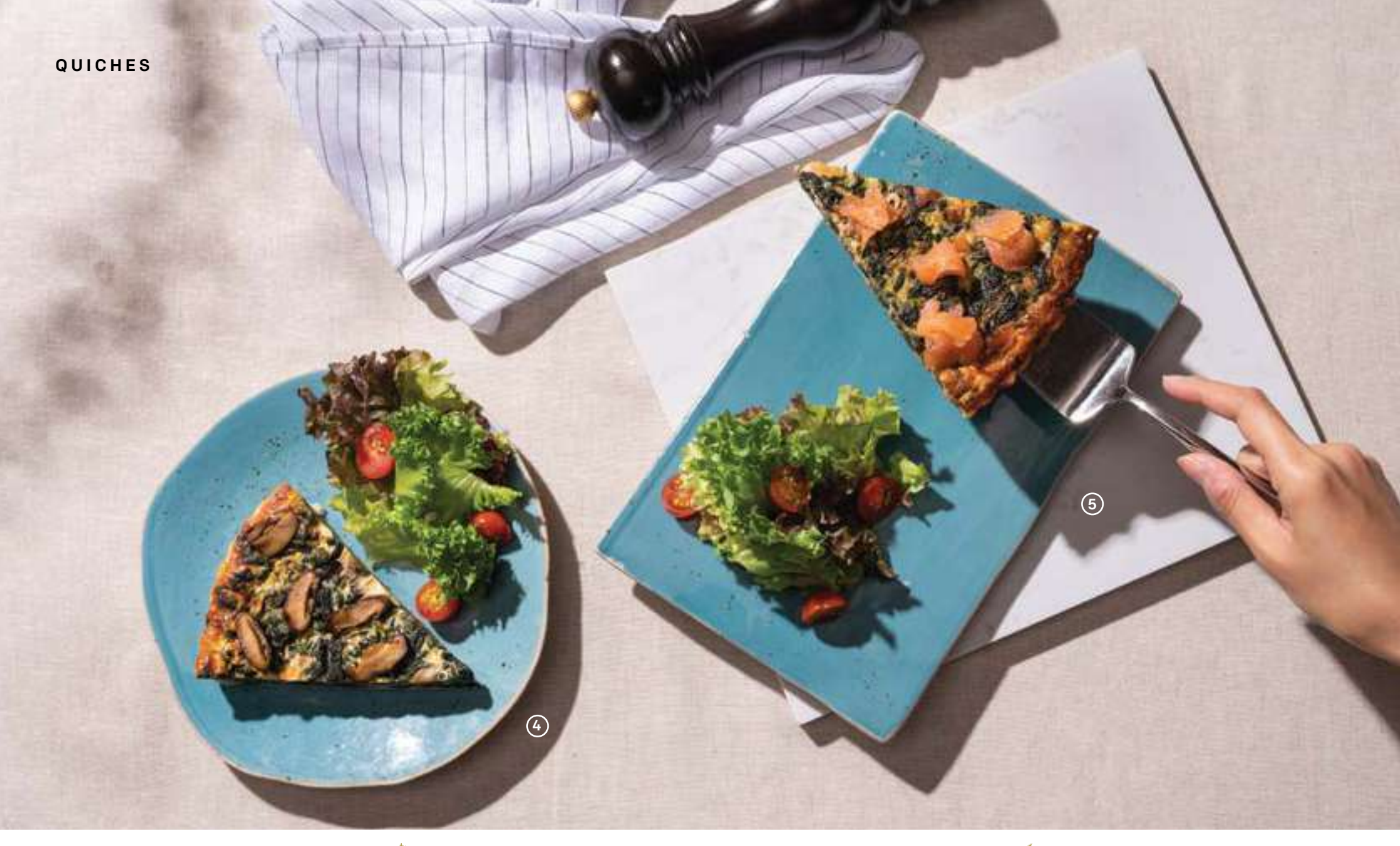
4. Mushrooms Spinach and Truffle Quiche 🥕 Paris Mushrooms, Baby Spinach, Truffle, Mesclun Salad