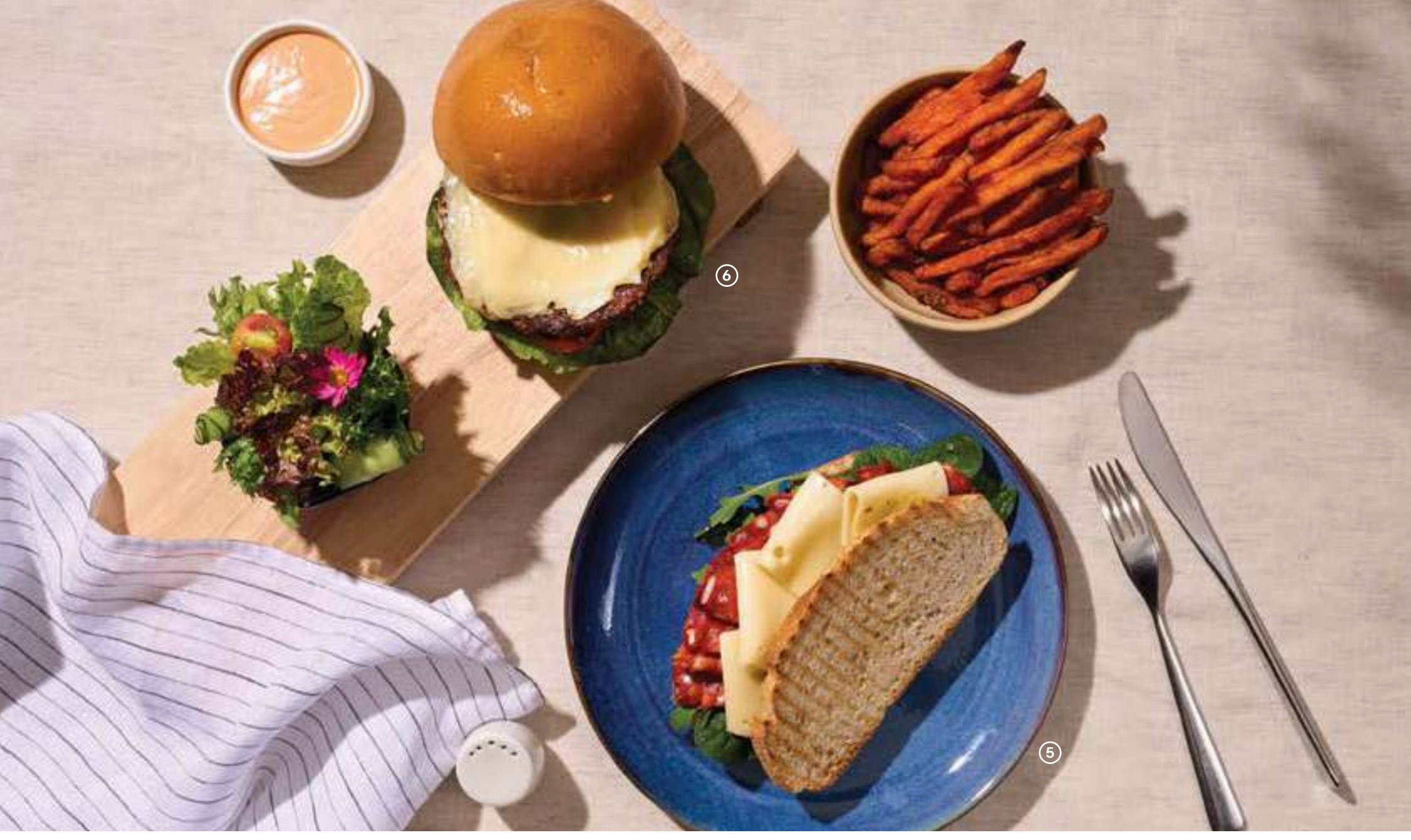
5. Vegan Cheese and Chorizo Toasties 🔊 🥡 "Made with Kindness" Sourdough, Cheese, Chorizo, Pesto, Mesclun Salad

6. Vegan Burger 🥡 390 Plant Based Patty, Bun, Cheese, Jalapenos, Lettuce, Sriracha Mayo, Sweet Potato Fries