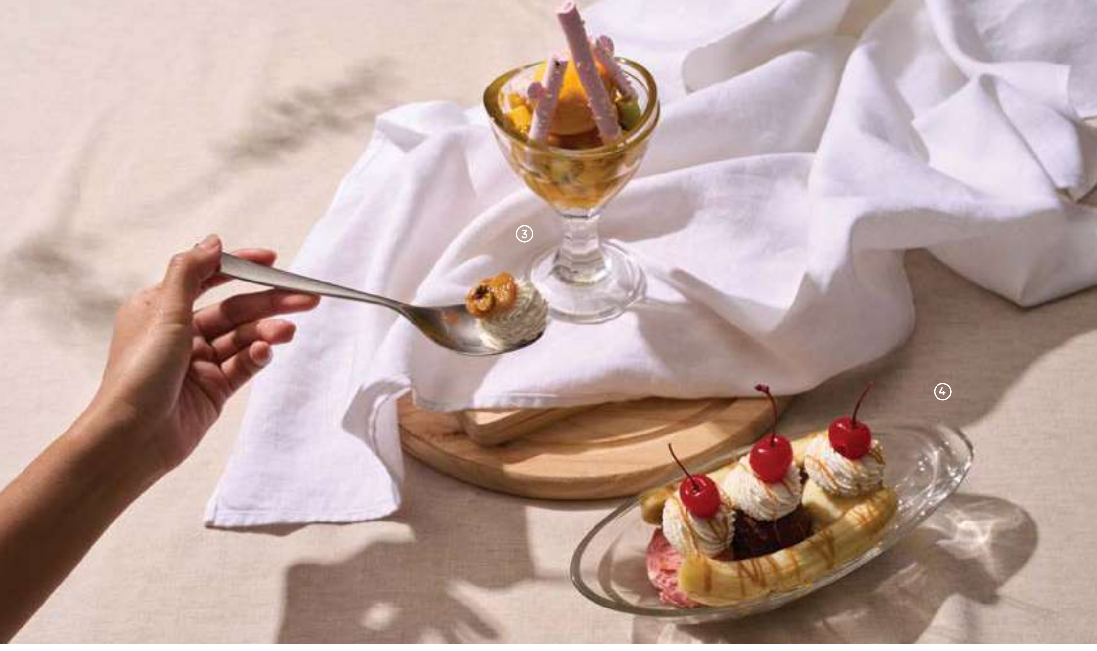
3. Wild & Exotic 🅕 🍮