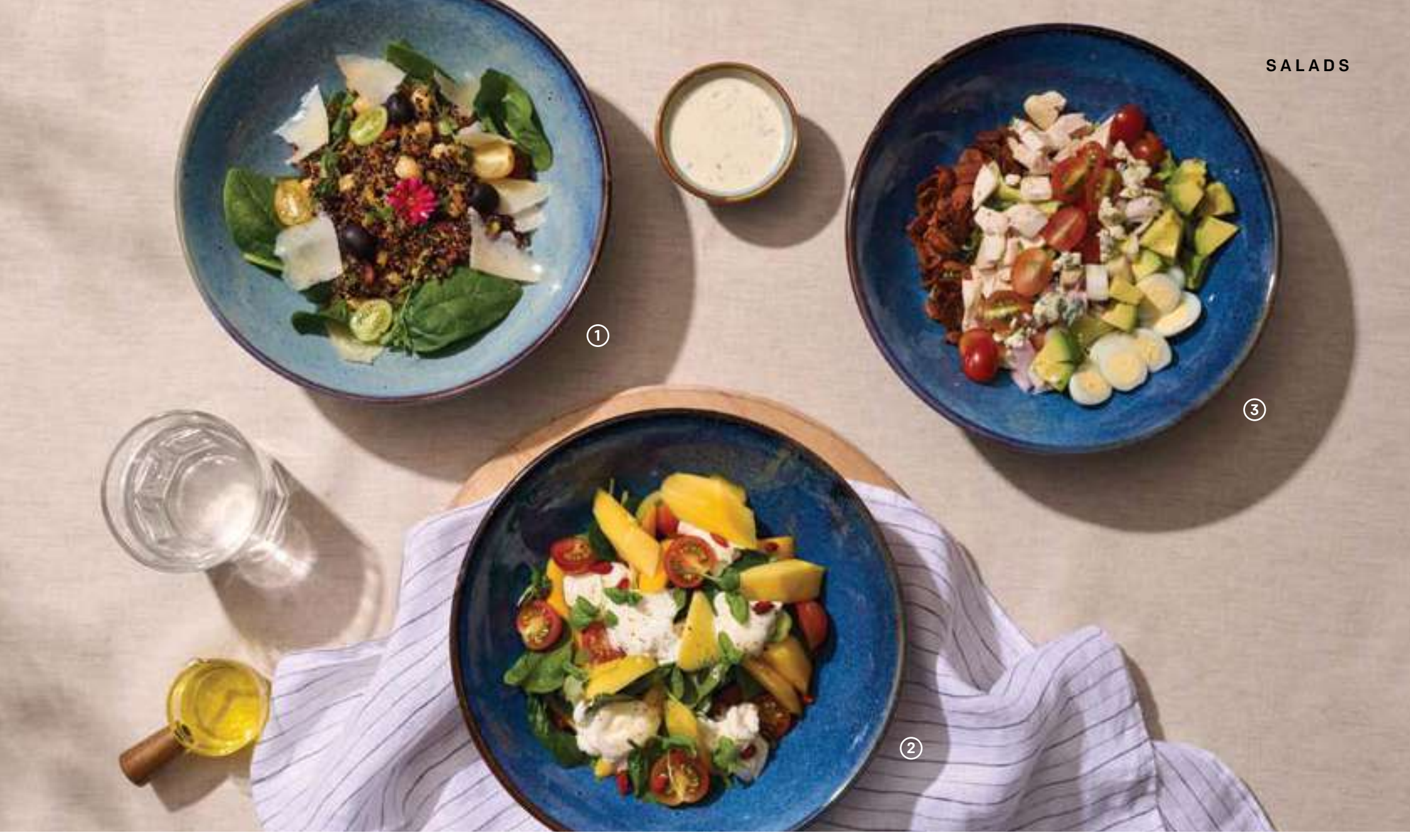
Quinoa Salad 260 Baby Spinach, Chickpeas, Cherry Tomatoes, Bell Pepper, Parmesan Cheese, Lime Juice