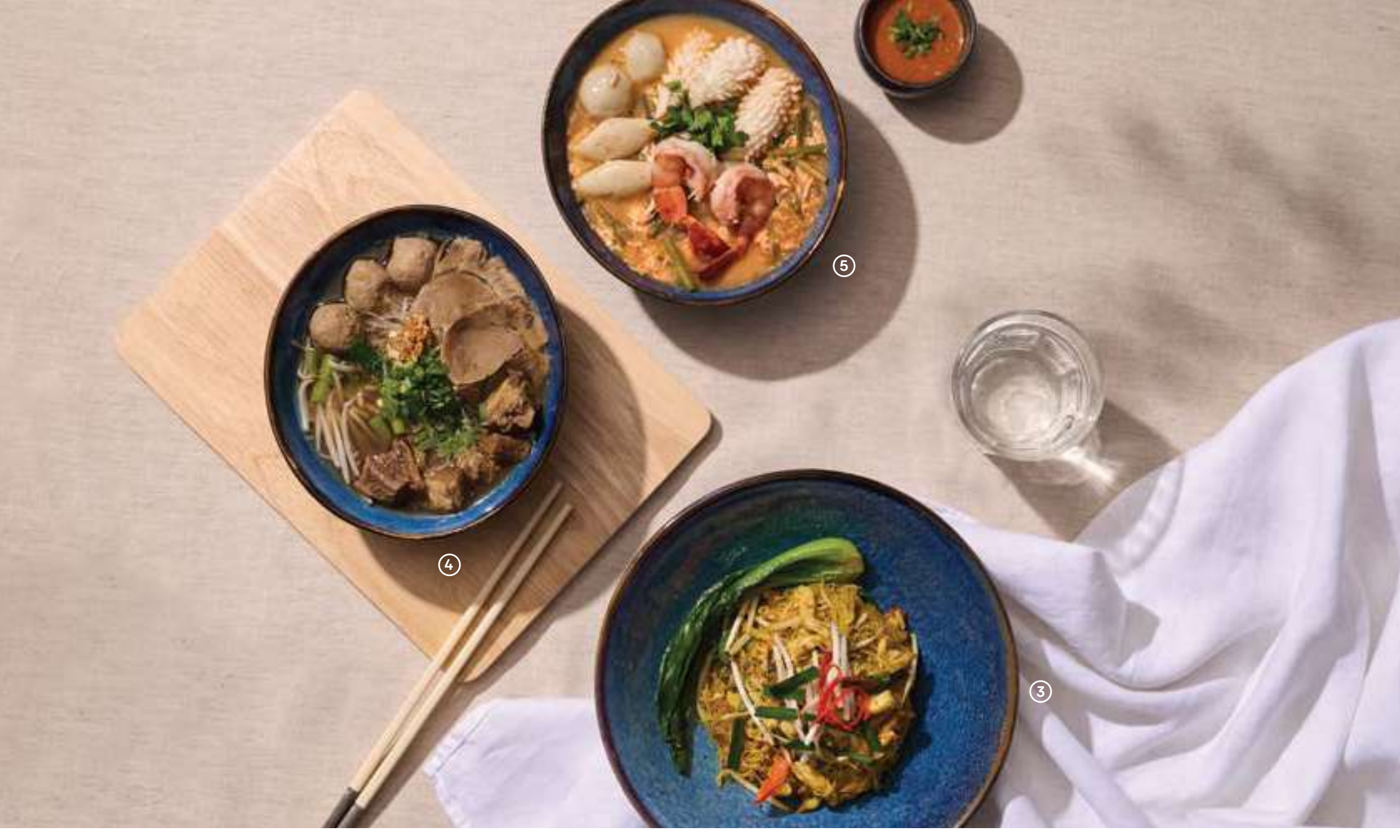
420 3. Singapore Noodle Vermicelli Noodles, Chicken, Bean Sprouts, Bok Choy, Capsicum, Spring Onion