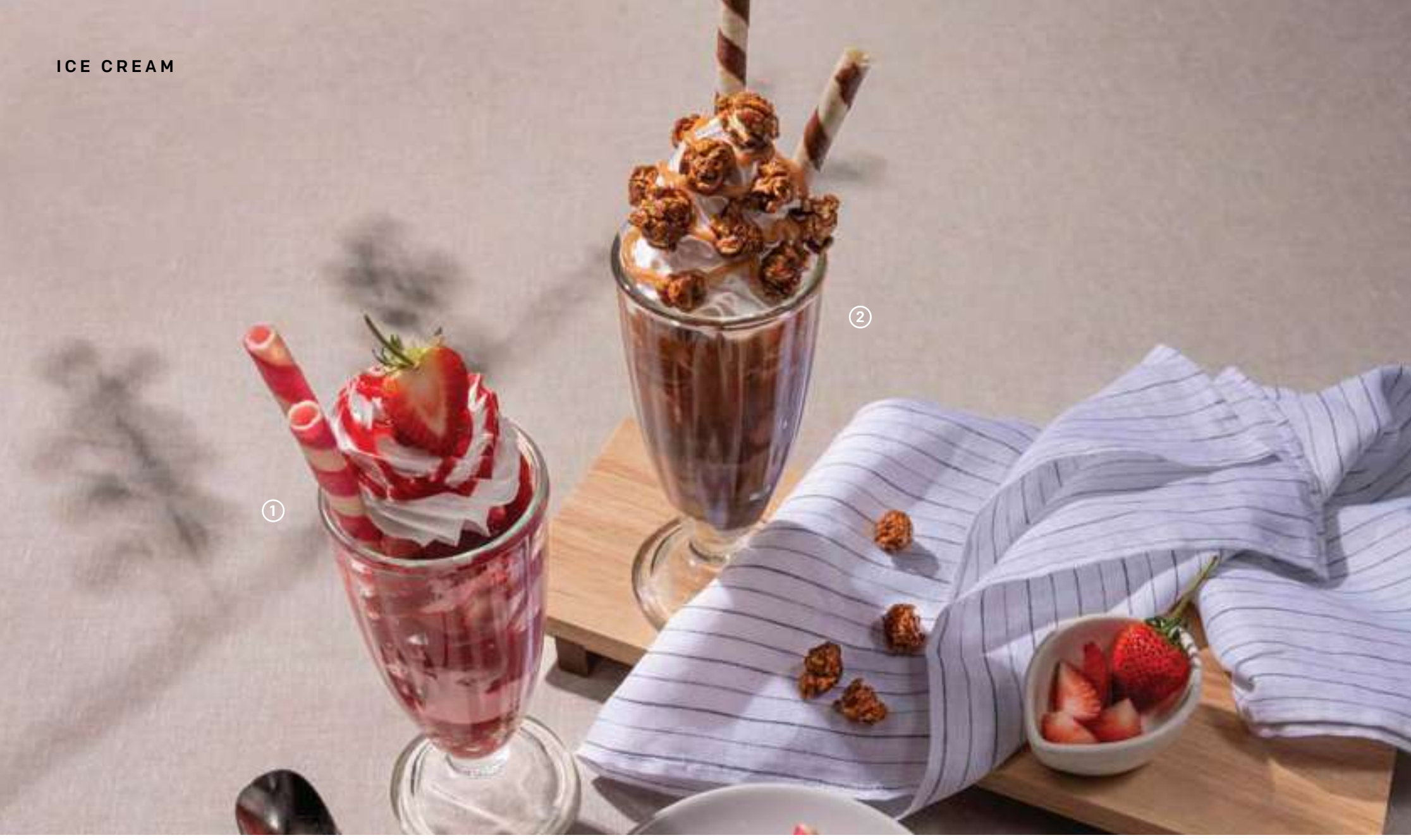
1. I Love You Strawberry Much 💉 🏊 250 Strawberry Coulis, Crunchy Cookie Dough, Sprinkles, Strawberry Waffle