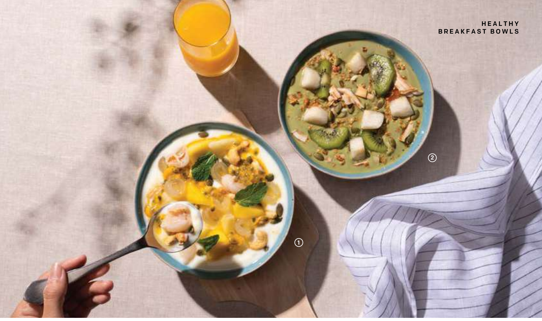
1. Thai Tropical Fruits Bowl > 300 Pineapple, Lychee, Longan, Mango, Passion Fruit, Pumpkin Seeds, Roasted Cashews