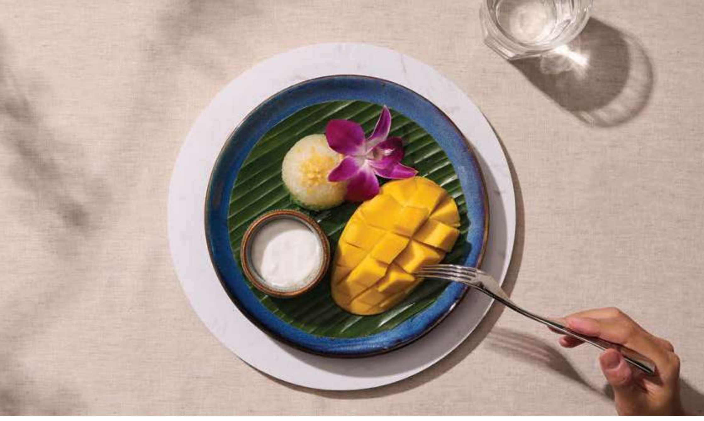
Mango Sticky Rice * 280 Duo Sweet Sticky Rice, 'Nam Dok Mai' Mango, Crispy Mung Bean, Coconut Cream