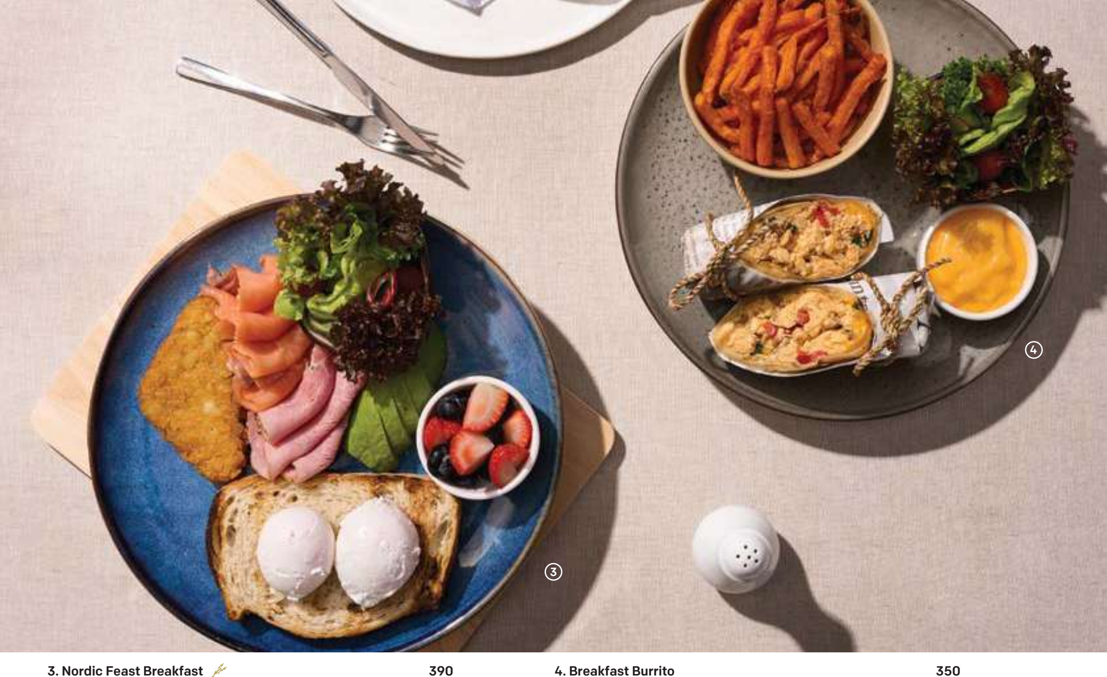
3. Nordic Feast Breakfast 🎉 Eggs of Your Choice, Smoked Salmon, Avocado, Red Berries, Beef Pastrami, Mesclun Salad, Hash Browns, Sourdough Toasty