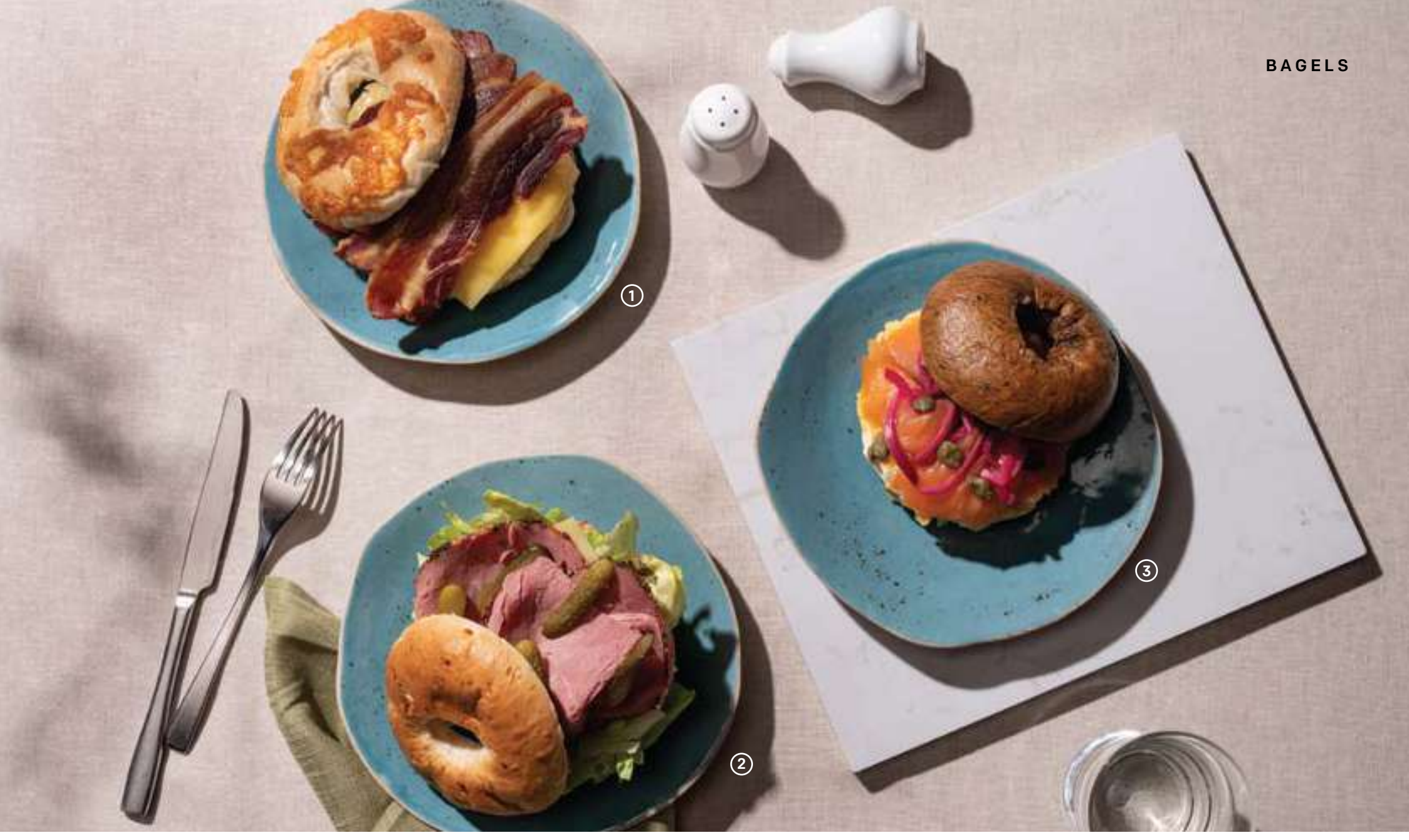
Bacon, Egg and Cheese Bagel 300 Cheddar Cheese Bagel, House Smoked Bacon, Fried Egg, Gouda Cheese