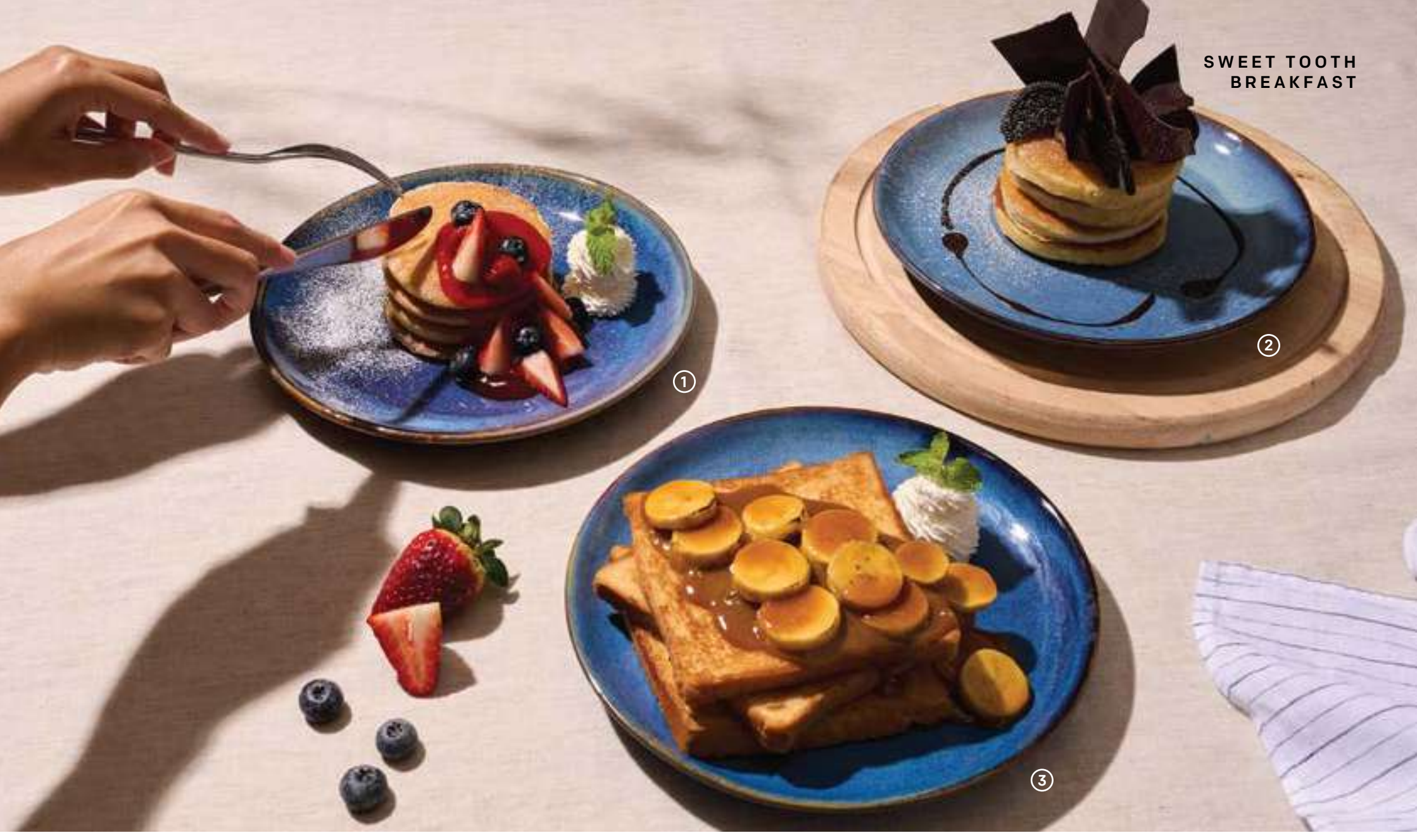
Red Fruits Pancakes 320 Buttermilk Pancakes, Berry Compote, Vanilla Whipped Cream