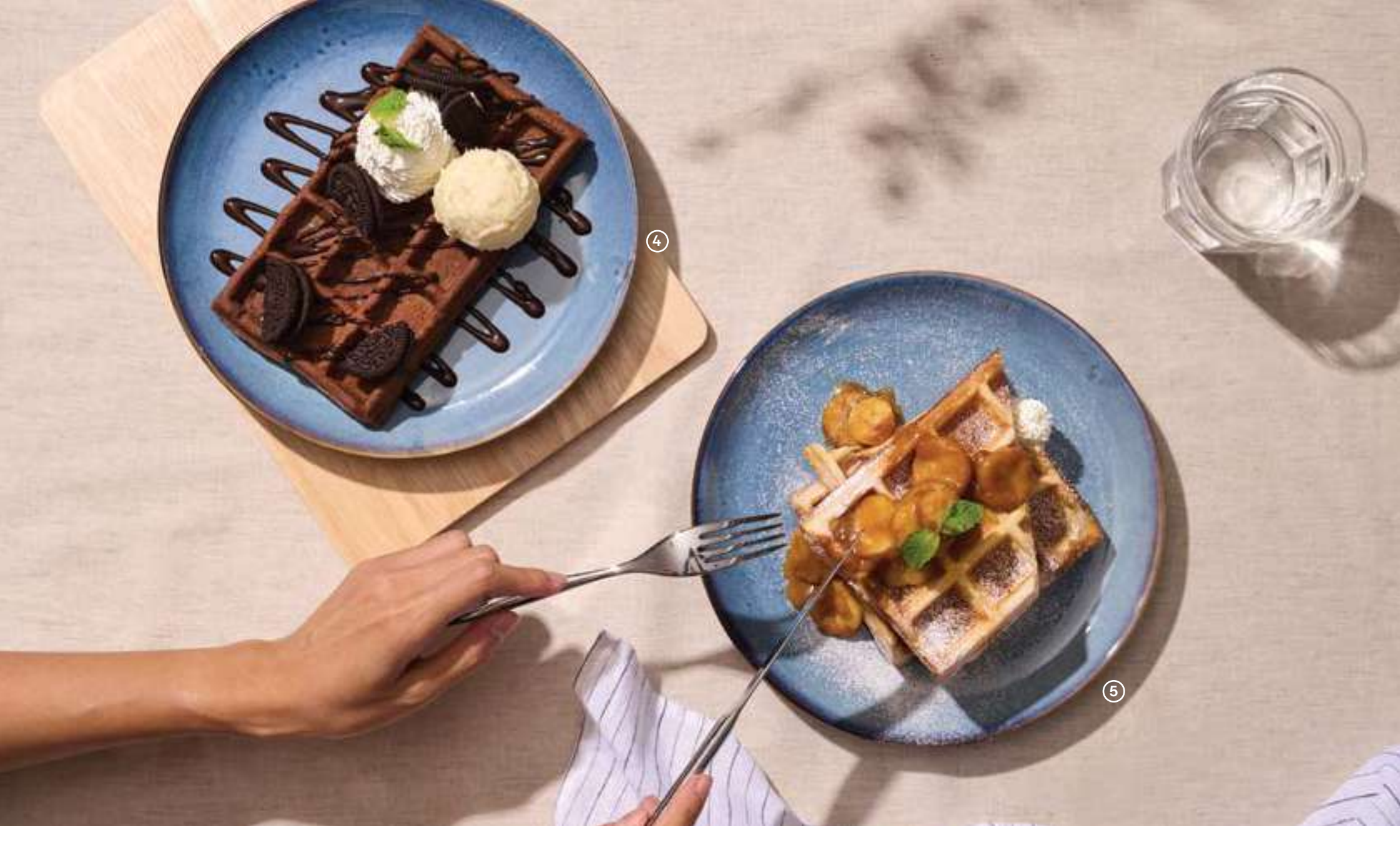
4. Oreo Waffle 🥕 🔊 300 Waffle, Oreo Cookies, Chocolate Fudge, Vanilla Ice Cream. Chantilly Cream