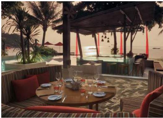
THE BISTRO @ THE BEACH

Embrace Anantara Rasananda Koh Phangan Villas' gourmet delights in a choice of venues, all in keeping with the island's authentic setting. Explore flavours from around the world whilst enjoying the cool ocean breeze. Savour delectable flavours and cuisines at any of our Koh Phangan restaurants.