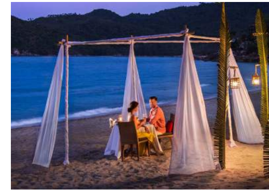
DINING BY DESIGN

Enjoy the ultimate Anantara Rasananda Koh Phangan Villas dining experience. Choose from exotic beachfront Locations and degustation menus for a memorable evening. Our staff will personalise the occasion and make sure everything is delivered to your specifications.