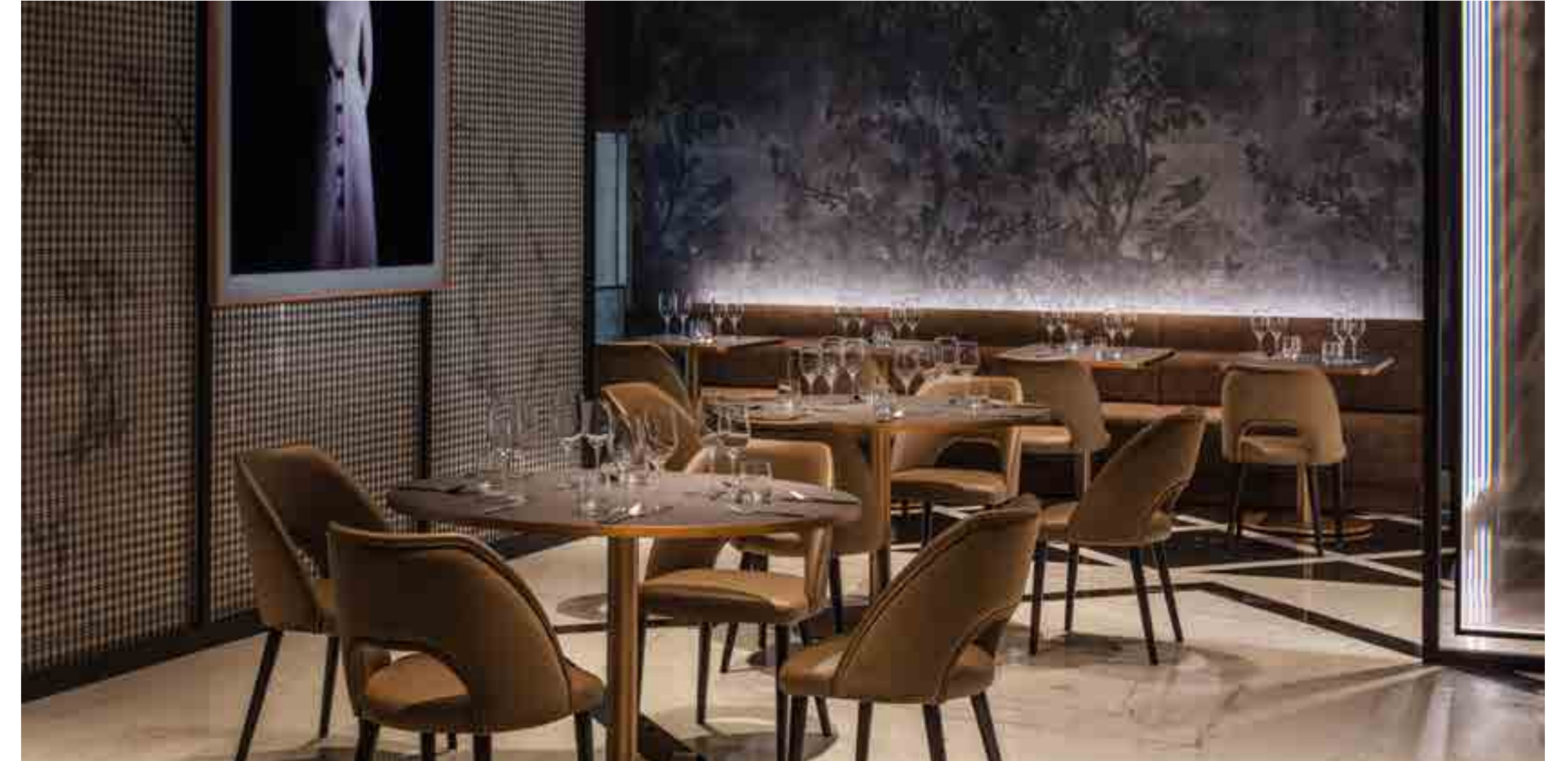
LA FONTANA RESTAURANT

La Fontana Restaurant, with its large windows overlooking the Fountain of Naiads, is the perfect venue for elegant banquets.