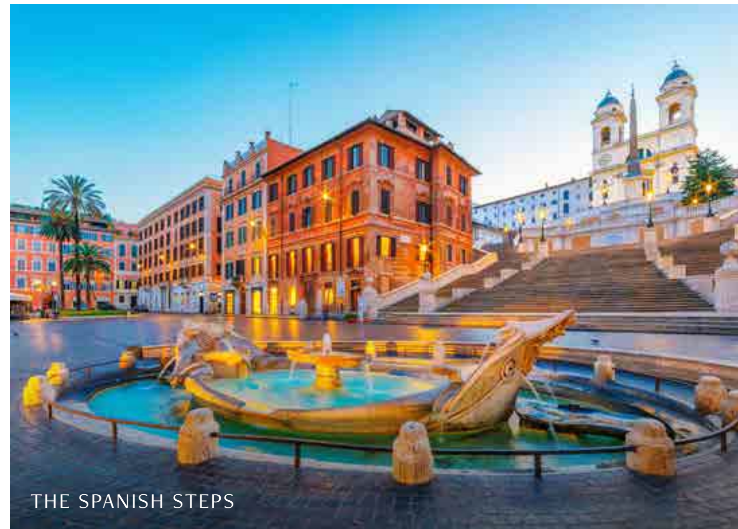
THE SPANISH STEPS