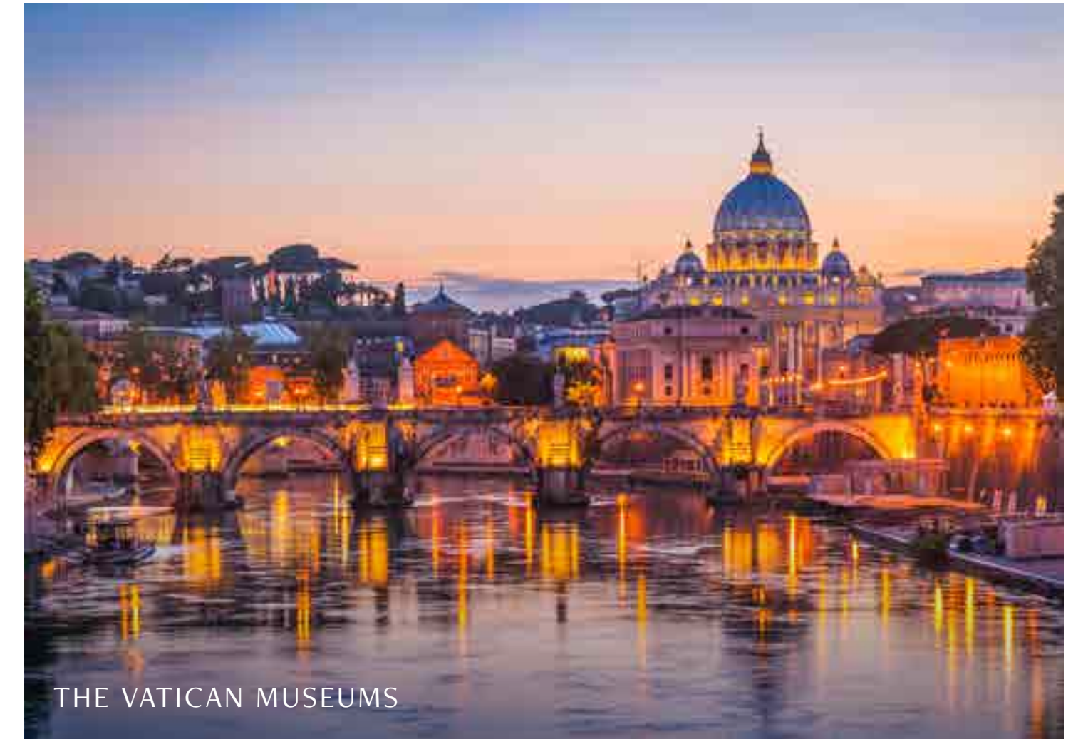
THE VATICAN MUSEUMS