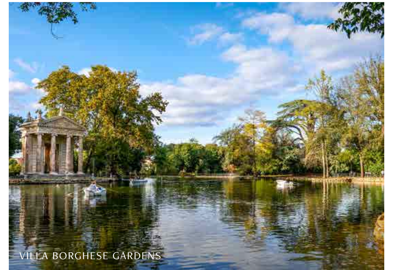
VILLA BORGHESE GARDENS