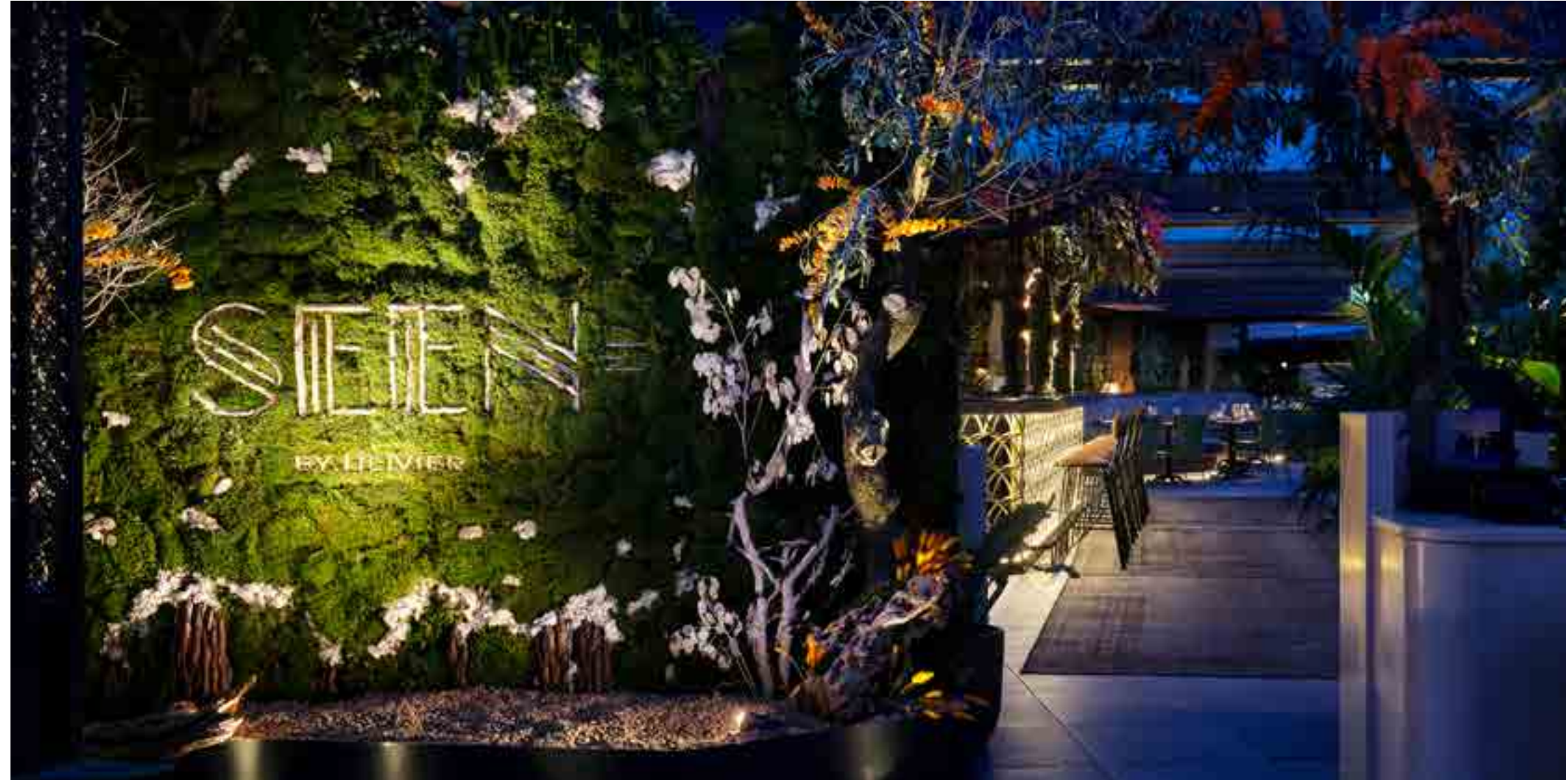
SEEN BY OLIVIER

The rooftop terrace, with its breathtaking views over the city, is the ideal setting for lifestyle events or wedding celebrations.