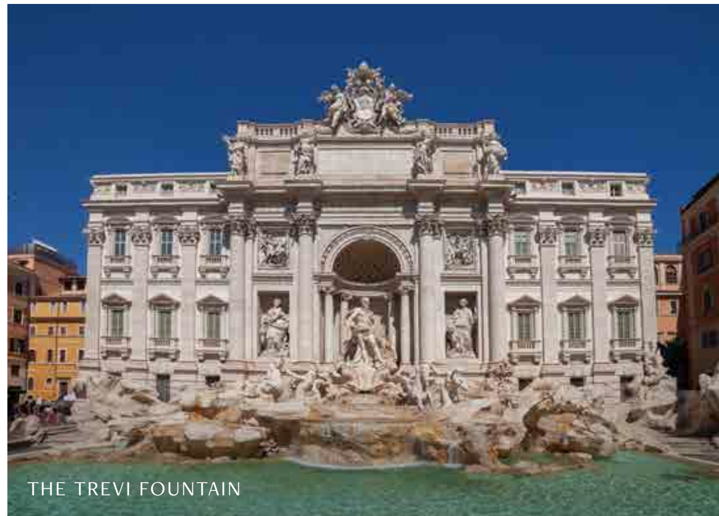
THE TREVI FOUNTAIN