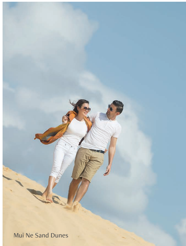
Mui Ne Sand Dunes