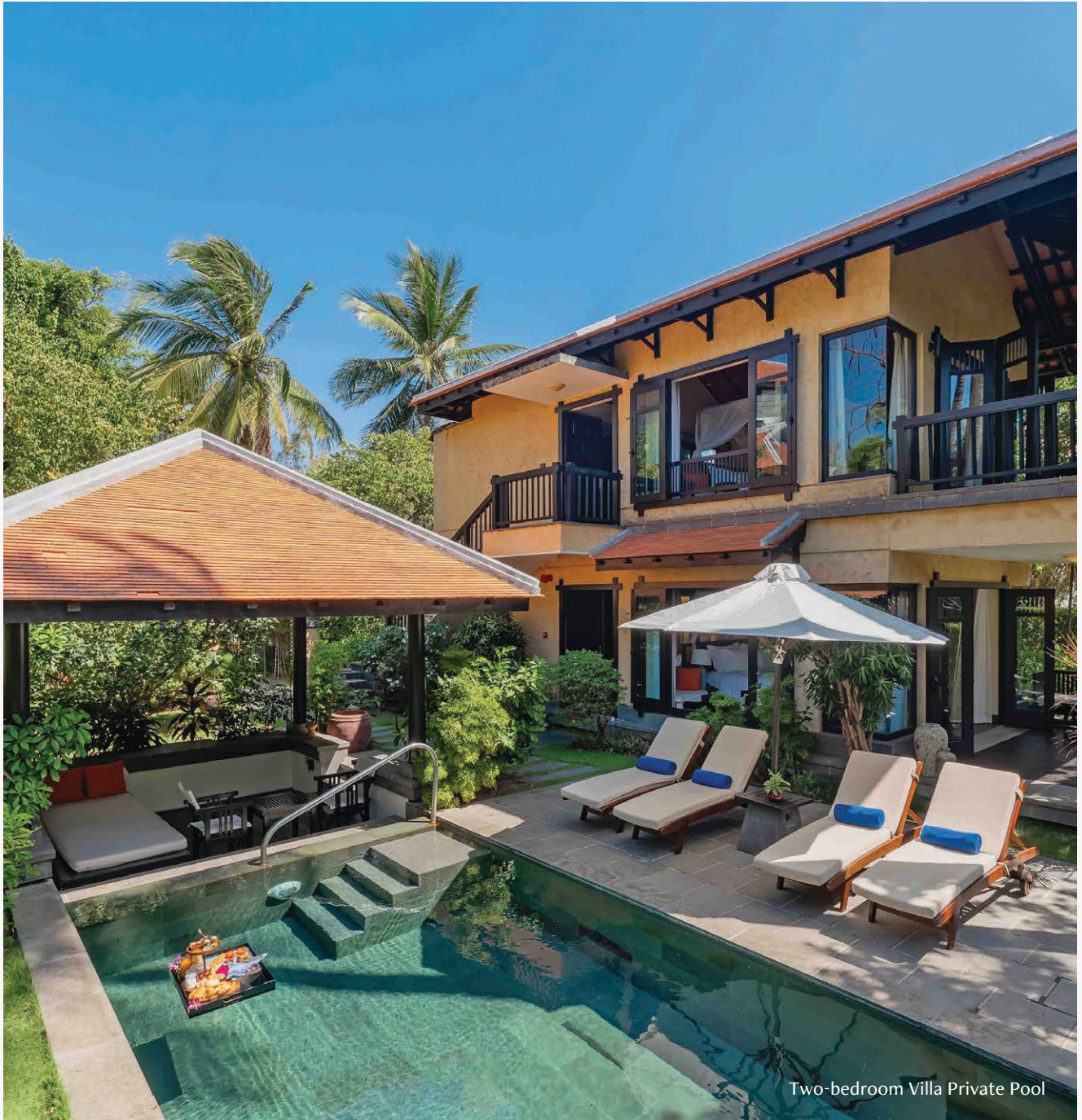
Two-bedroom Villa Private Pool