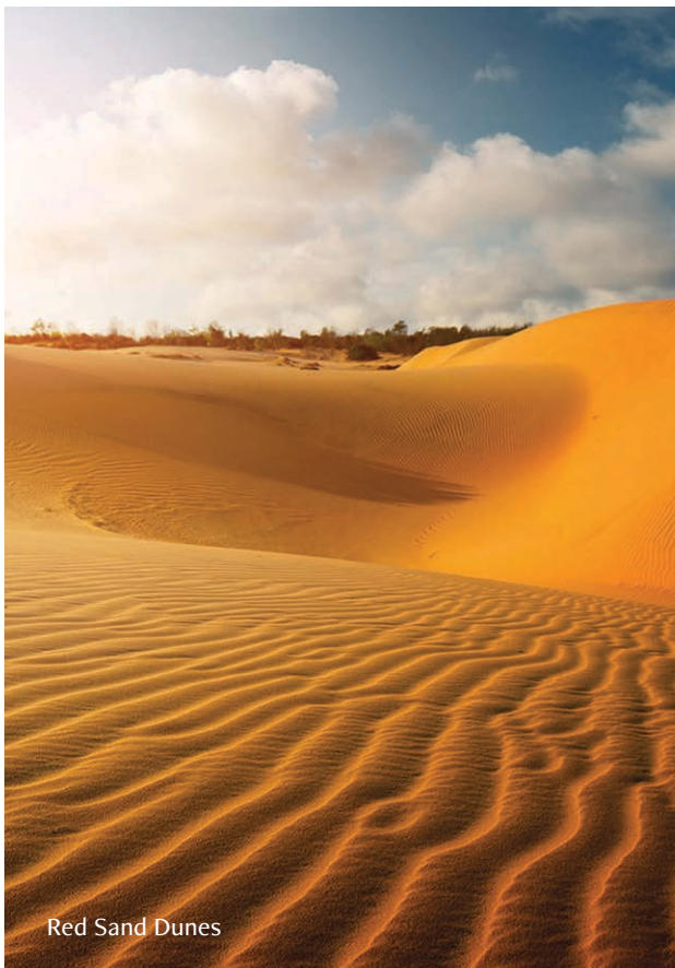
Red Sand Dunes