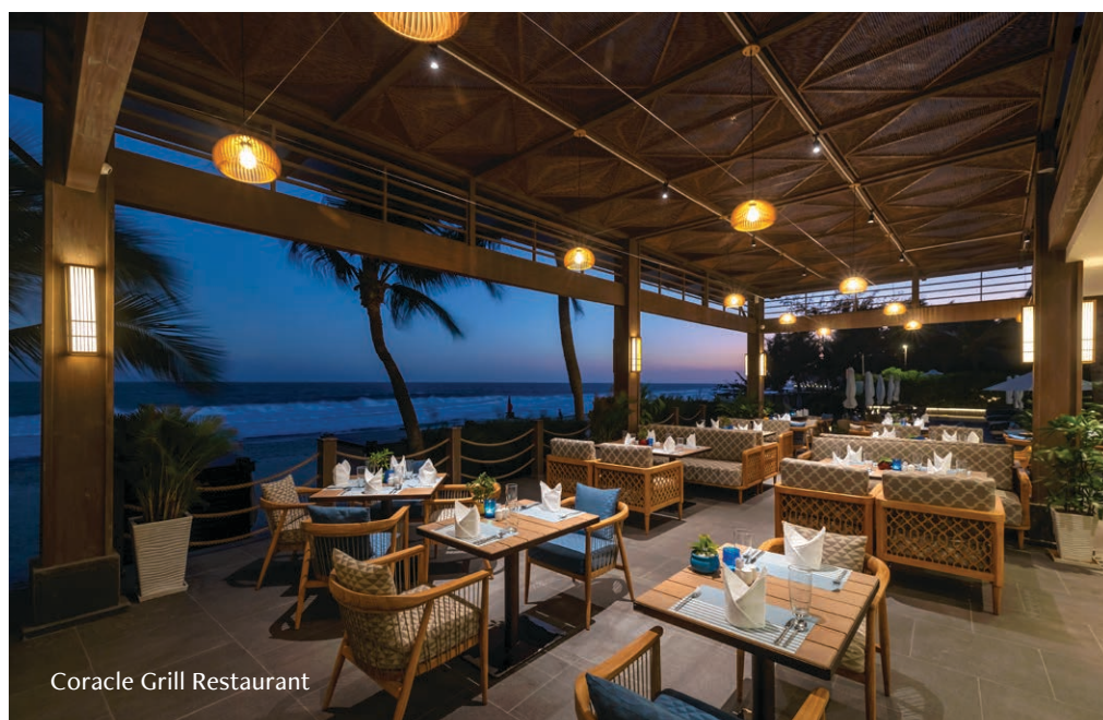
Coracle Grill Restaurant