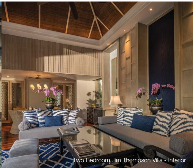
Two Bedroom Jim Thompson Villa - Interior