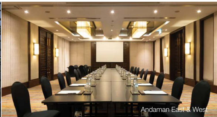
Andaman East & West