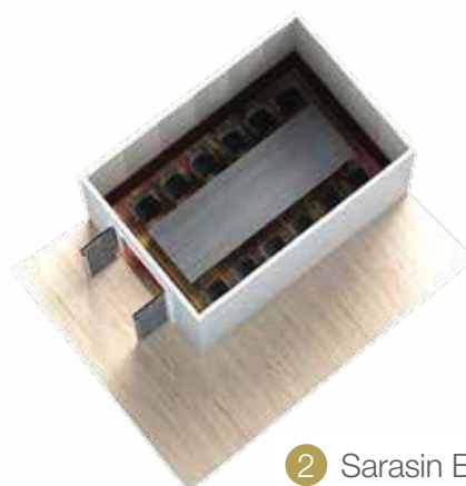
2 Sarasin Boardroom