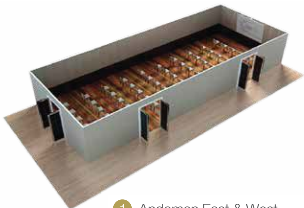
1 Andaman East & West