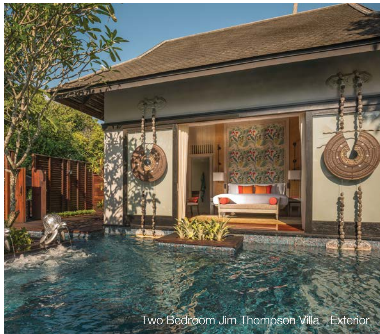
Two Bedroom Jim Thompson Villa - Exterior