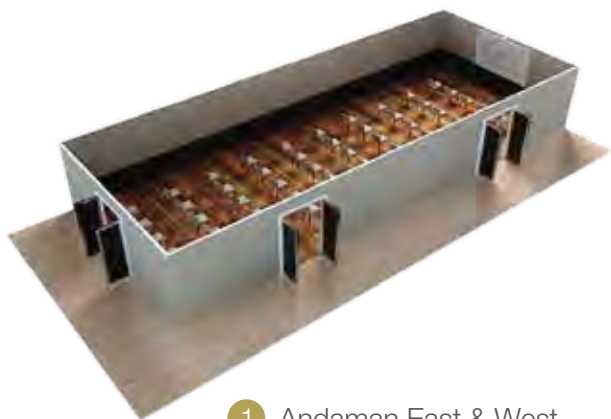
1 Andaman East & West