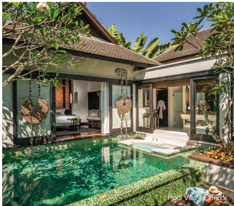
Pool Villa - Exterior