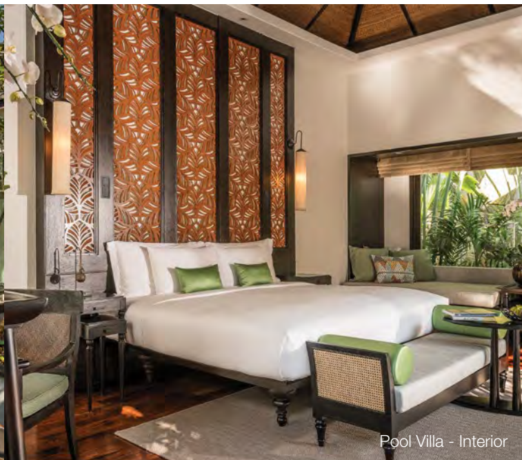
Pool Villa - Interior