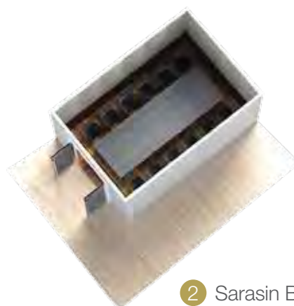
2 Sarasin Boardroom