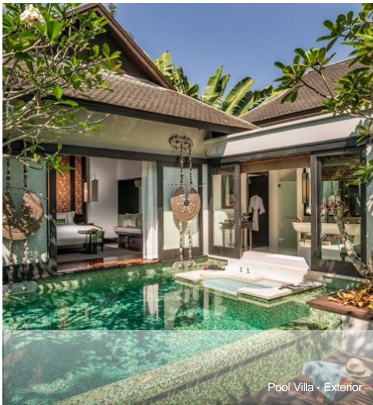
Pool Villa - Exterior