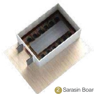
2 Sarasin Boardroom