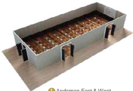
1 Andaman East & West