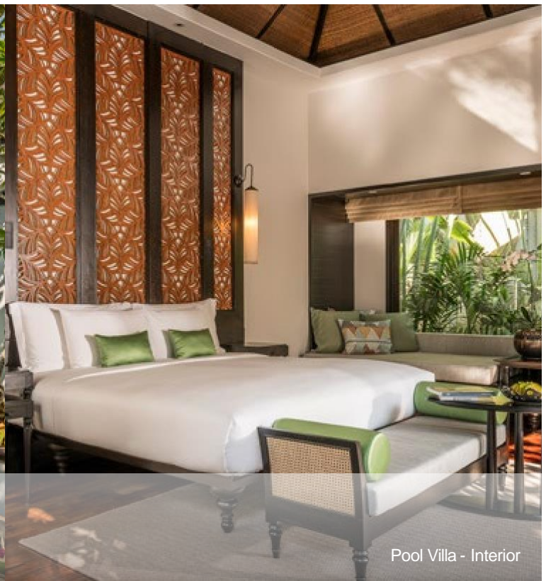
Pool Villa - Interior