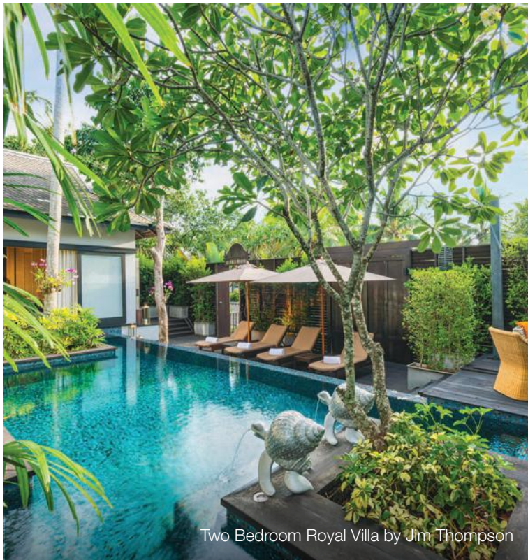
Two Bedroom Royal Villa by Jim Thompson