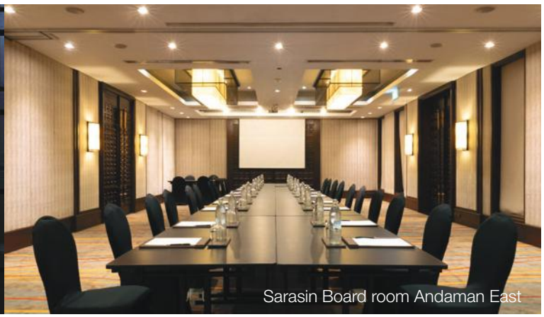
Sarasin Board room Andaman East