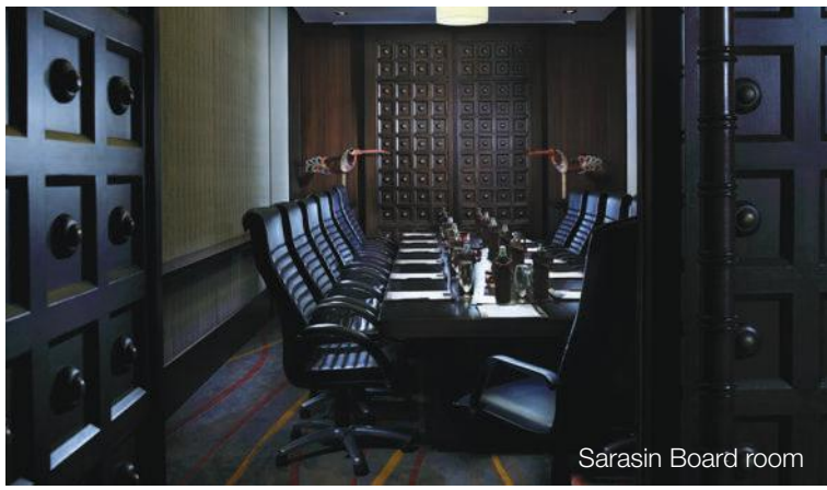
Sarasin Board room