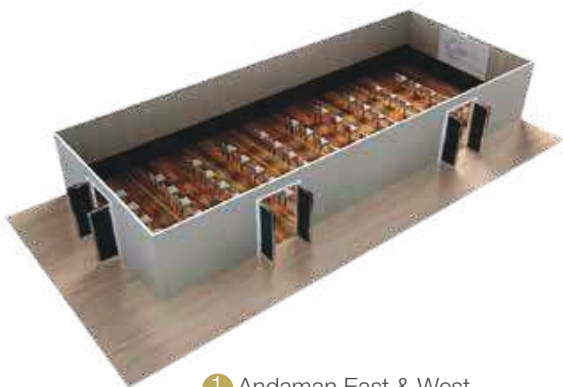
1 Andaman East & West