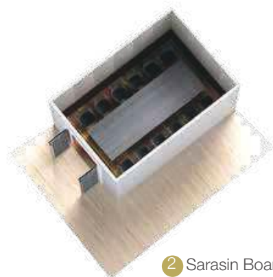
2 Sarasin Boardroom