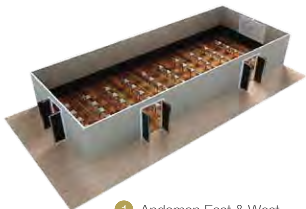
1 Andaman East & West