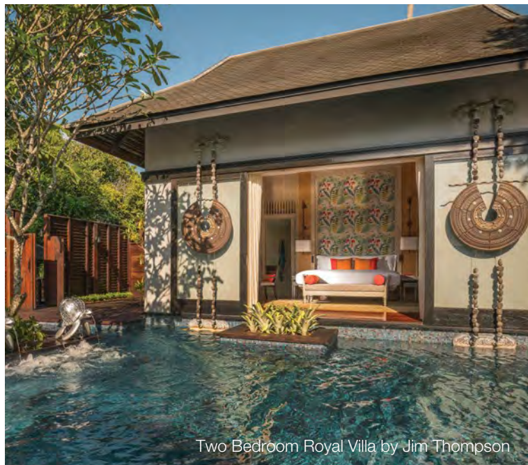
Two Bedroom Royal Villa by Jim Thompson