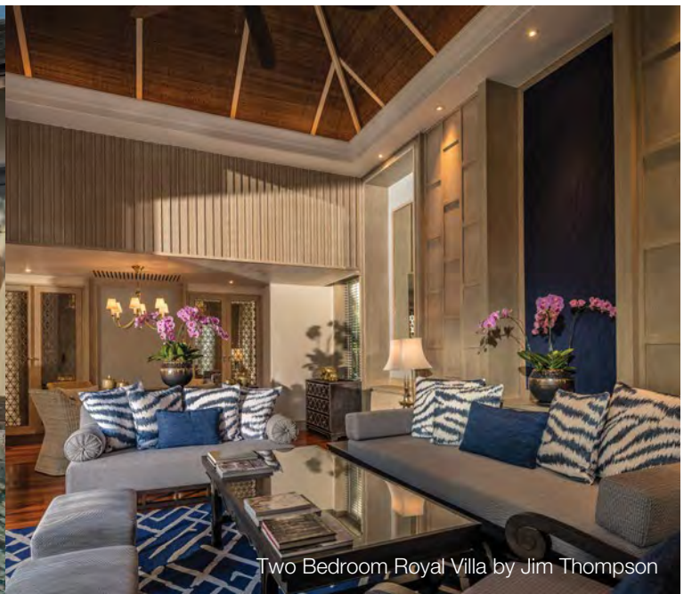
Two Bedroom Royal Villa by Jim Thompson