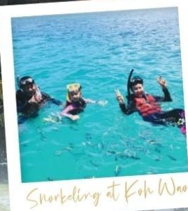
Snorkeling at Koh Wao

อุทยานแห่งชาติหมู่เกาะอ่างทอง Ko Ang Thong National Park Thai กรมอุทยานแห่งชาติ สัตว์ป่า และพันธุ์พืช