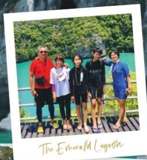
The Emerald Lagoon

Maximum 14 Guests Semi-Private Excursion