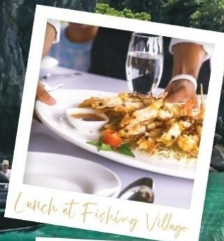
Lunch at Fishing Village