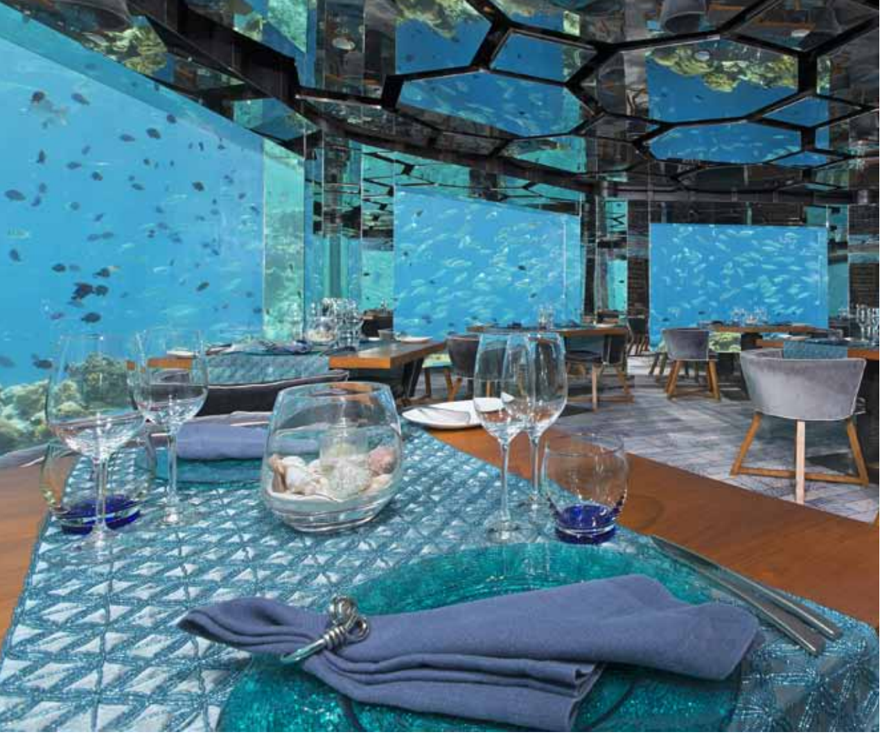
Anantara Kihavah offers a range of activities so you can personalise your stay. From dining at an underwater restaurant to private film screenings under the stars, there's no end to what your butler can arrange for your stay. Staff are helpful, friendly and knowledgeable, and go out of their way to make you feel at home.