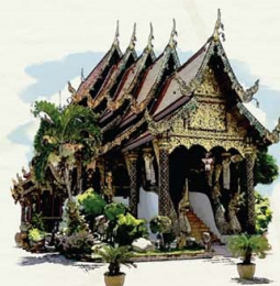
WAT KET KARAM