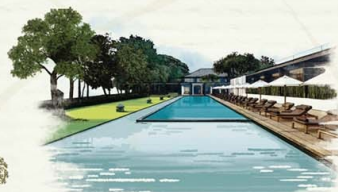
ANANTARA CHIANG MAI