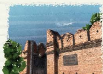
THA PHAE GATE