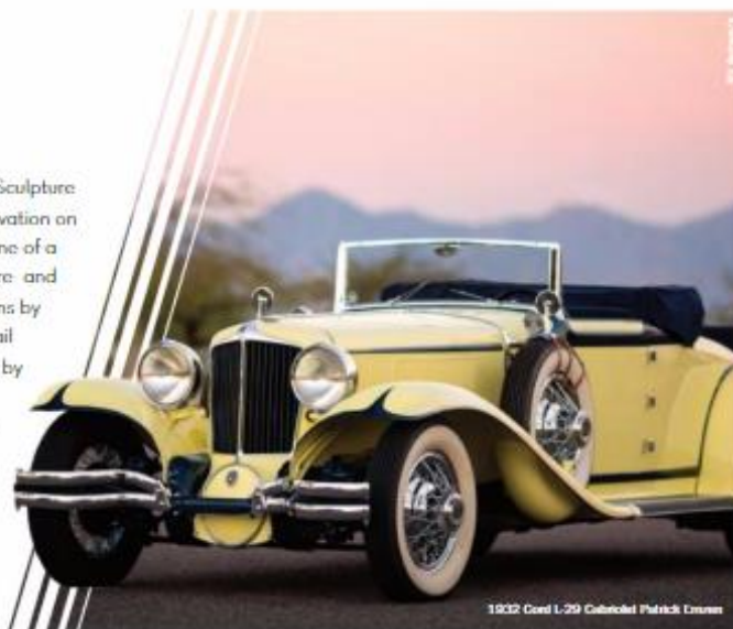
1932 Ford L-29 Cabriolet Patrick Cronan

2051 South Flagler Drive, West Palm Beach 561-832-5328 | ansg.org