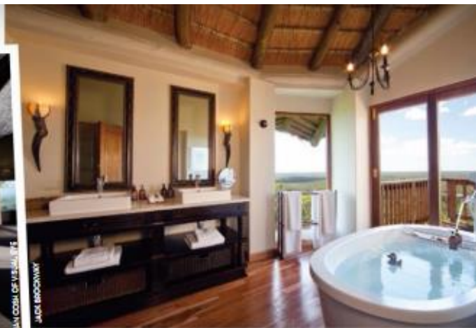
CLOCKWISE FROM ABOVE: BATHROOM WITH A VIEW AT ROCK LODGE AT ULUSABA; DURBAN SKYLINE; SPA AT THE OYSTER BOX; RHINOS IN SABIE SANDS; EXTERIOR AND PRIVATE DINING AT ULUSABA.

Lodge ( maeyasafari.com ), which oozes classic safari glamour and celebrates the gamut of pan-African art through interior design, all the while offering one of the most riveting experiences in Africa: the walking safari. If willing, you can leave the Land Rover behind and head into the bush on foot, alongside Maeya's expert rangers. Watching the shenanigans of an elephant herd from a vehicle is amazing, but witnessing this spectacle at eye-level—and completely exposed—well, that's another experience altogether. Nature enthusiasts, scientists, and intellectual types will appreciate guides who impart near doctorate-level knowledge as part of the Maeya visit.