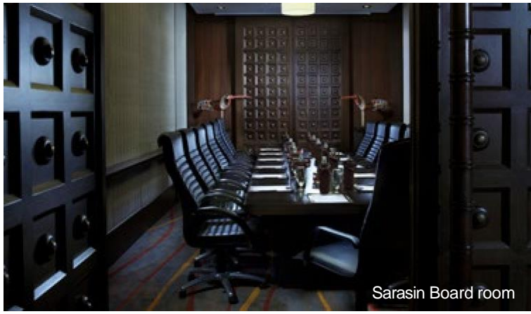
Sarasin Board room