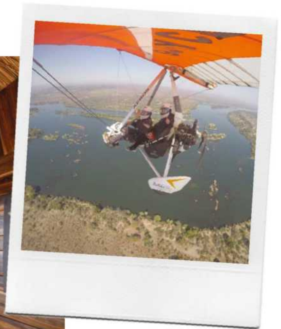
Above: A bird's-eye view. Left: The spa at the river's edge. In the Ukuchina massage, warm towels are used in kneading and compression movements to relieve muscle pain and tension.

The Zambezi is watering hole to a variety of animals, and if you're lucky enough to occupy a first floor room, at sunset you can see them come out to drink and play from your balcony – elephant, hippo, waterbuck, wildebeest, crocodile, and the 450 or so species of birds that call the area home. The region is a birdwatcher's paradise, and you could easily see about 50 different species a day. I'm convinced that when people talk glowingly about African sunsets, it's really the Zambezi sunset they're talking about: a deep amber corona melting across the horizon to a candy-pink marmalade sky.