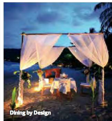
Dining by Design

personalised by the staff and you get to enjoy a romantic and private area on the beachfront with a choice of chef-designed menus. Not only that, if you'd like to make it more memorable, you can request for matching wines delivered during a specific time of your meal which will be accompanied by some entertainment.