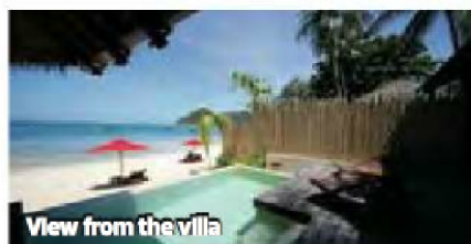
View from the villa