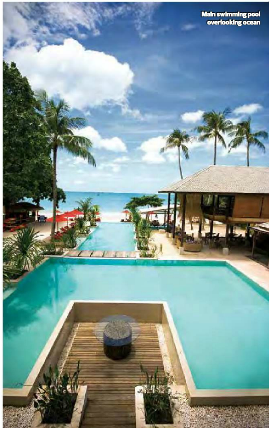
Main swimming pool overlooking ocean

Next was the room ... it definitely did not disappoint us.