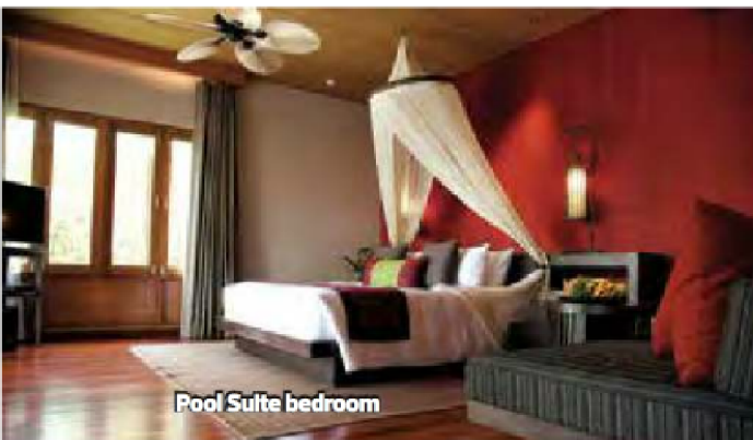
Pool Suite bedroom